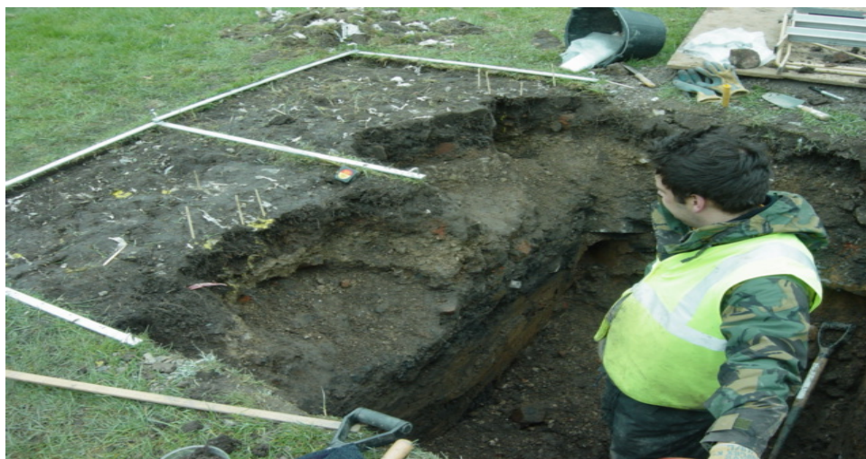
Fig. 2. Excavation of soil from within a trench to expose the marked, polyurethane-filled burrows of Lumbricus terrestris in Preston Cemetery