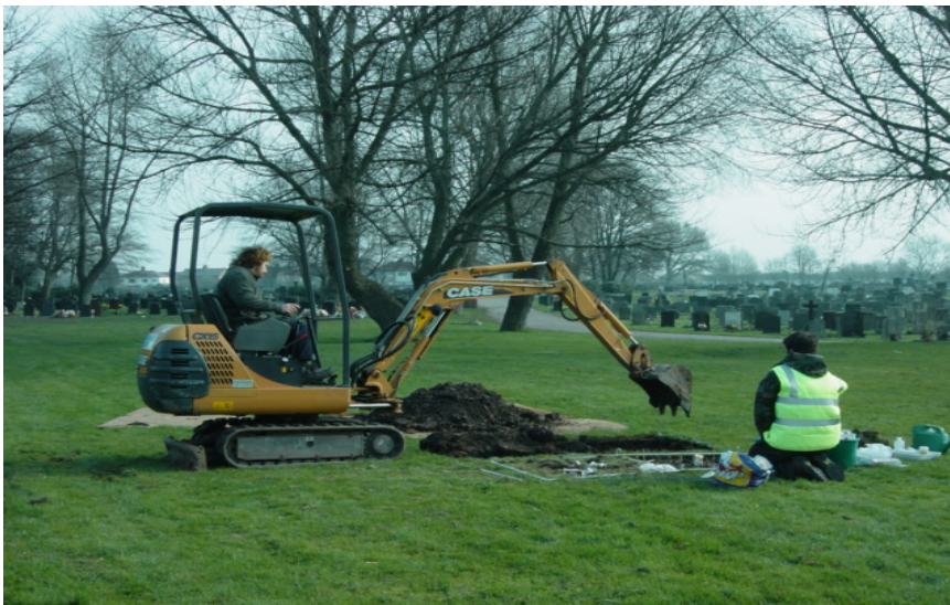
Fig. 1. Excavation of trench in Preston Cemetery beside area where Lumbricus terrestris burrows have been located and cast with coloured polyurethane resin