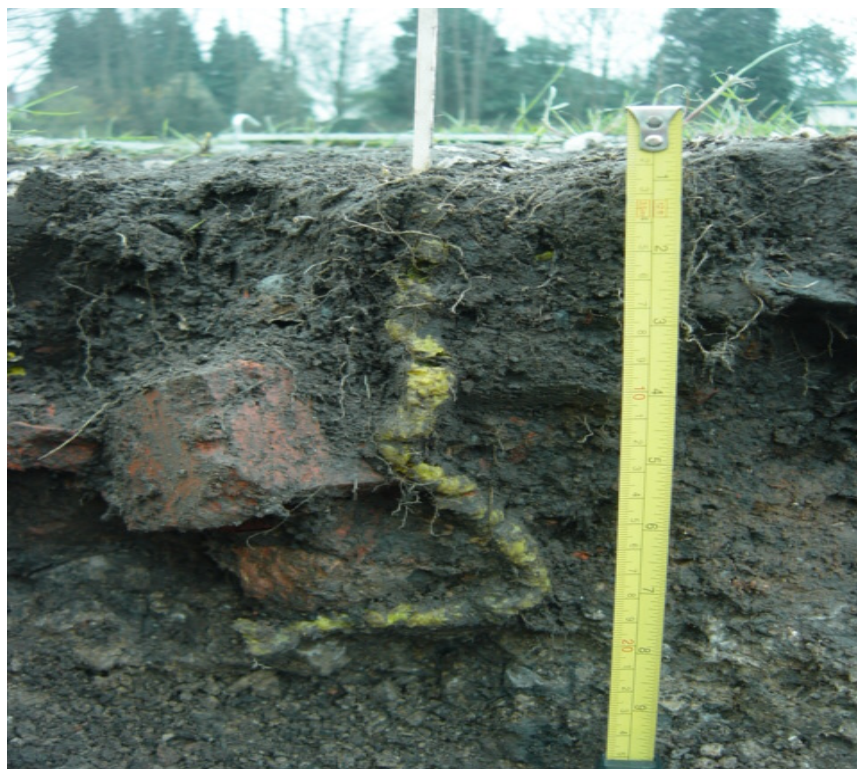
Rys. 3. Udział gatunków dżdżownic wypłoszonych roztworem proszku musztardowego na cmentarzu w Preston (Ac - Aporrectodea caliginosa , Al - Aporrectodea longa , Ar - Aporrectodea rosea , Lc - Lumbricus castaneus , Lf - Lumbricus festivus , Lr - Lumbricus rubellus , Lt - Lumbricus terrestris )