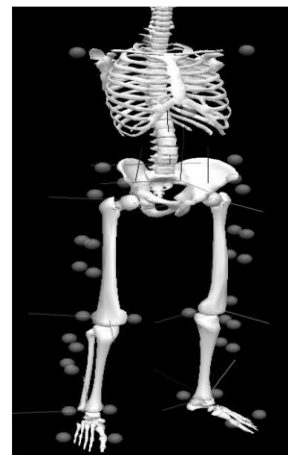
Figure 1. Marker configuration used in the current investigation.

Participants each completed five repetitions in each squat condition, using their normal squat technique. The load was consistent for both conditions, with participants lifting 70% of their back squat 1 repetition maximum. Participants completed their squats in a randomised order. To acquire knee joint kinetic information, the right foot was positioned onto a piezoelectric force platform (Kistler Instruments Ltd., Alton, Hampshire) which operated at a sampling frequency of 1,000 Hz.