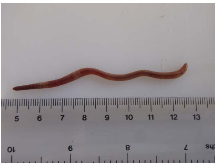
Fot.1. Two images of the same clitellate (mature) individual of D. alpina .