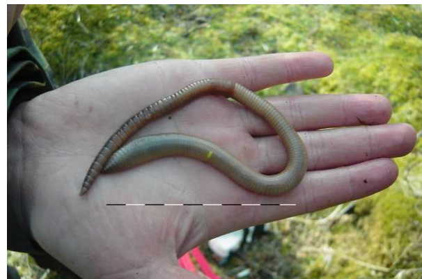
Fig. 3. Large dew worm from Papadil with yellow Visual Implant Elastomer (VIE) tag immediately prior to release; scale bar of 10 cm.

Tagging/Fencing Treatment (TF) Midden-related dew worms were treated as in (T) but then the square metre plot was isolated with fencing (as described above). This was to restrict movement away from the treatment square, if home burrows were compromised by the vermifuge extraction process.