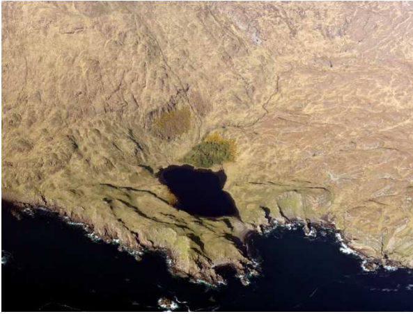
Fig. 2. Oblique aerial view of Loch Papadil, Rum, taken from the WSW. The woodland/grassland area investigated is clearly visible at the Loch margin.

The trees were planted at Papadil and a hunting lodge built more than 100 years ago, when Rum was a shooting estate (Wormell 1968). The lodge is now in ruins but the wooded area including Rhododendron ponticum and gorse Ulex europaeus thicket remain. The soils at Papadil are exceptional for Rum, as they are naturally fertile brown forest soils. Ragg & Bogie (1958) and Ragg & Ball (1964) describe these soils in detail, but the main features are the freely-draining and crumbly structure in the A and B horizons, the friable consistency, together with a relatively uniform brown colour. Rooting depth and absence of large stones are favourable to plant growth and to deep burrowing earthworms. The relatively high levels of sunshine, combined with rainfall of only 1,780 mm per annum (compared with the highest records from some locations on Rum of 3,302 mm) are factors considered largely responsible for the presence of these soils in this location in Rum.