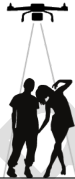
Figure 1. StreetGamez