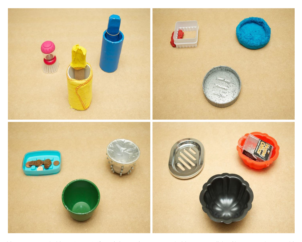
Fig. 1 The four object sets. Novel objects ( centre ) (from left to right , with designated function in brackets): puppet stand covered with Mr. Sheen duster (dusting), silver sandpaper covered soap dish (cutting playdough), unaltered green bowl (holding coins), black jelly mould (making music). Function match test objects ( left ): dish brush, cutter,

match and shape match were introduced and the positioning of the test objects on the table (left or right) were all counterbalanced. One TD child, two children with ASD and one DD child only completed three out of the four trials and one TD child only completed one out of the four trials, due to inattention.