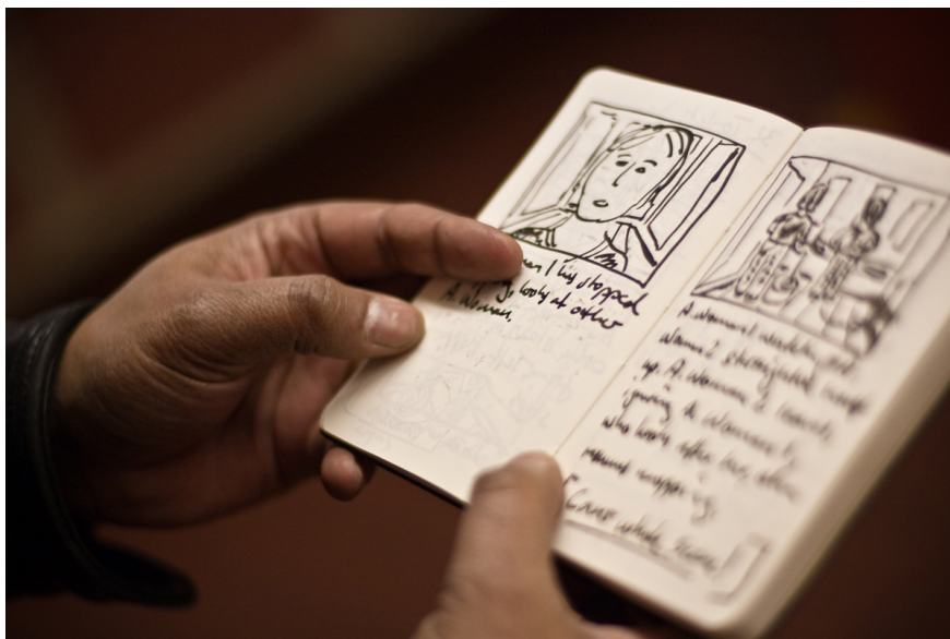
A storyboard page from The Silent Accomplice (2010)

Abundance could well be a sign of health. It is certainly a sign of wealth - physically and metaphorically. Abundance is, by definition, somehow quantitative. In an abundant society we are rich and possess riches and we determine this in numbers: money, barrels of oil, number of art galleries, cinema attendances, number of films produced, company turnover, profit margins and so on. In all spheres, numbers have proliferated and emerging out of this is the dominance of the science of matrixes and statistics. Increasingly, in a world of abundance, we assign value through matrixes and statistical analyses 4 .