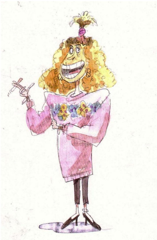
Marge Stenson from "Crapston Villas,"