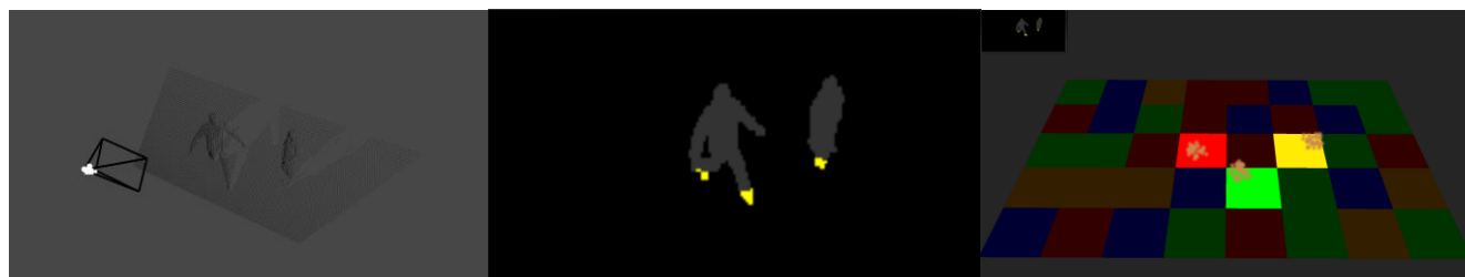
Figure 3: Left: Depth map rendered. Center: Feedback detection with grouping points of interest near the floor surface. Right: Player feet positions projected onto interactive surface.

The system is based on the Google Tango 3 device which is used for tracking player movements as well as rendering the game graphics. Presently the system is limited to projections on horizontal planar surfaces where the system currently only tracks players' feet (see Figure 3). While the Tango point cloud detection is limited on average to 10 FPS, more responsive detection is done by tracking feedback zones inside the captured image using Tango's rgb camera. The system distinguishes between players through colour tracking, hence in the current version unique footwear colour is required in order to play a multiplayer game. The tracking system utilizes depth camera and colour based tracking techniques. In order to enable easy integration with new and existing games, a decision was made to make our system compatible with Unity game engine and offer our player tracking and game projection solution as a Unity template better know as Unity prefab 4 . We decided on this in order to enable easy integration when modifying existing or creating new games that are compatible with our platform.