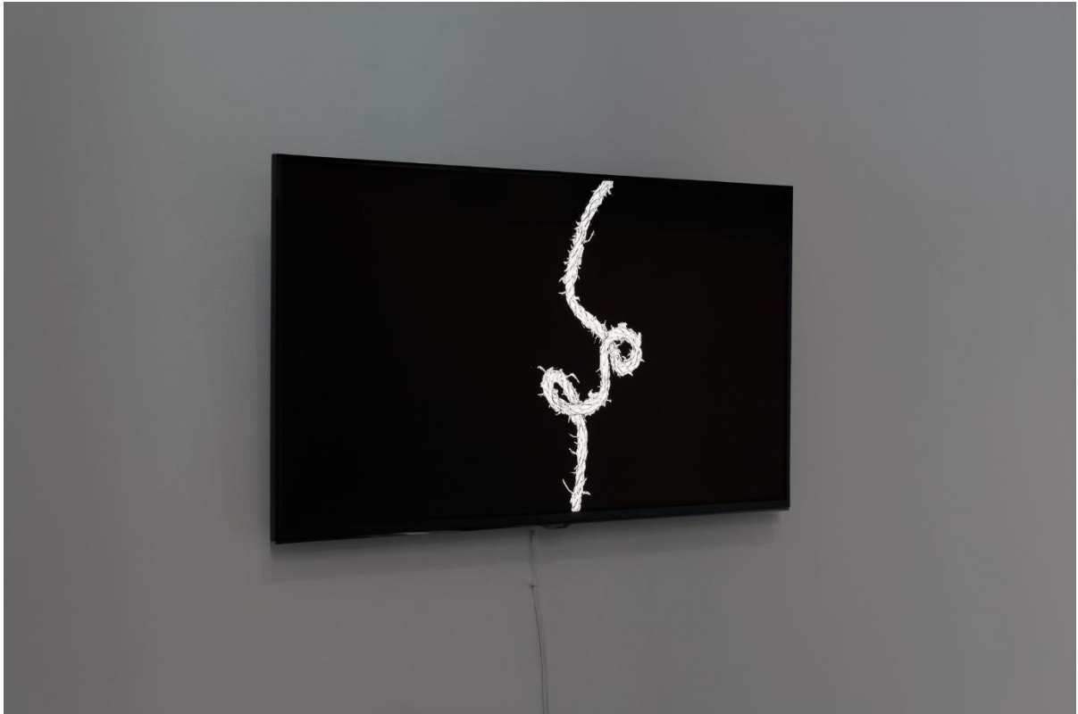
'Everyone wants revenge no 2' 2010/17, Animation, (1m 7sec)