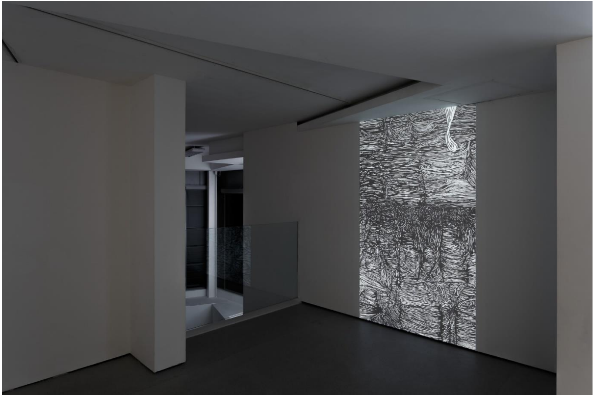
Restlessness, 2017, Animation, (2min) looped