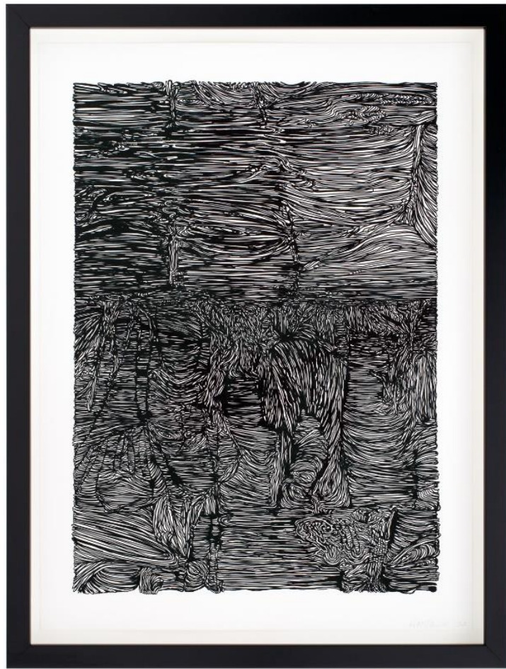
'Restlessness' 2017, Ink Jet print, 50cm ,30cm , edition 1/20