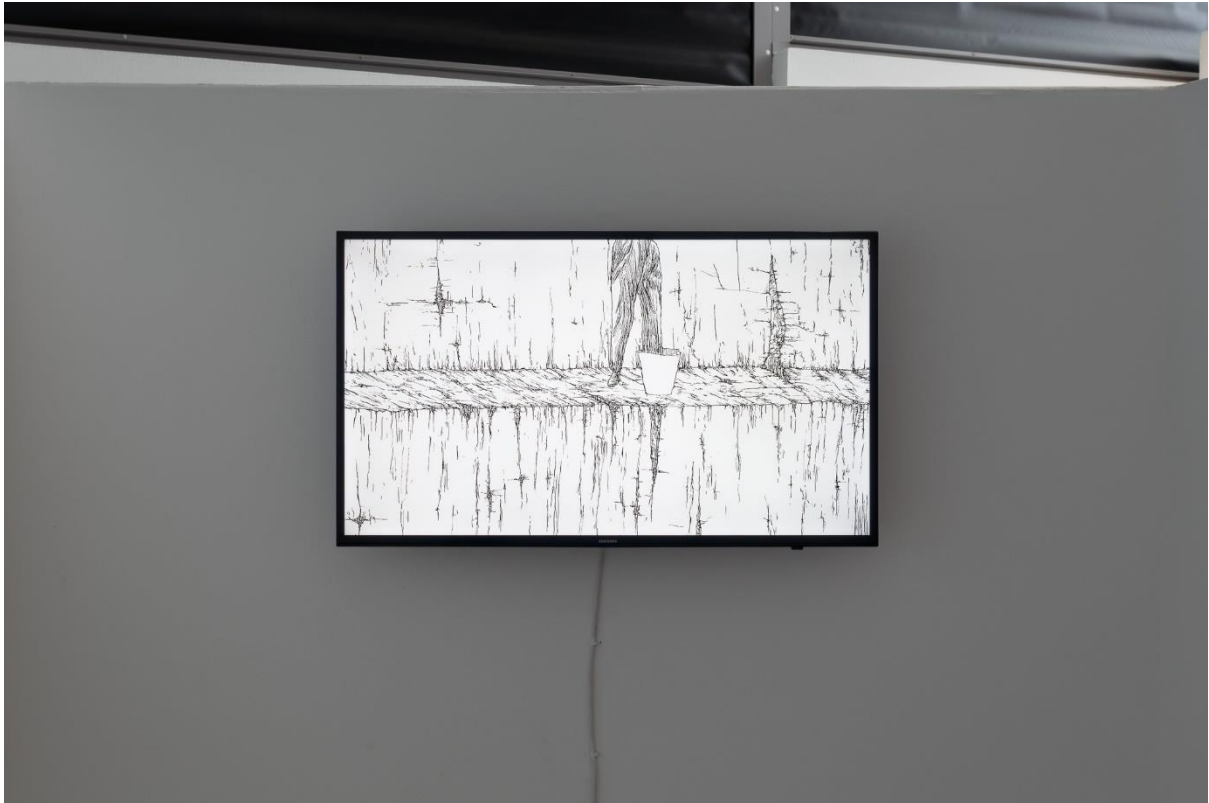
Bucket, 2013, Animation, (4min, 20sec)