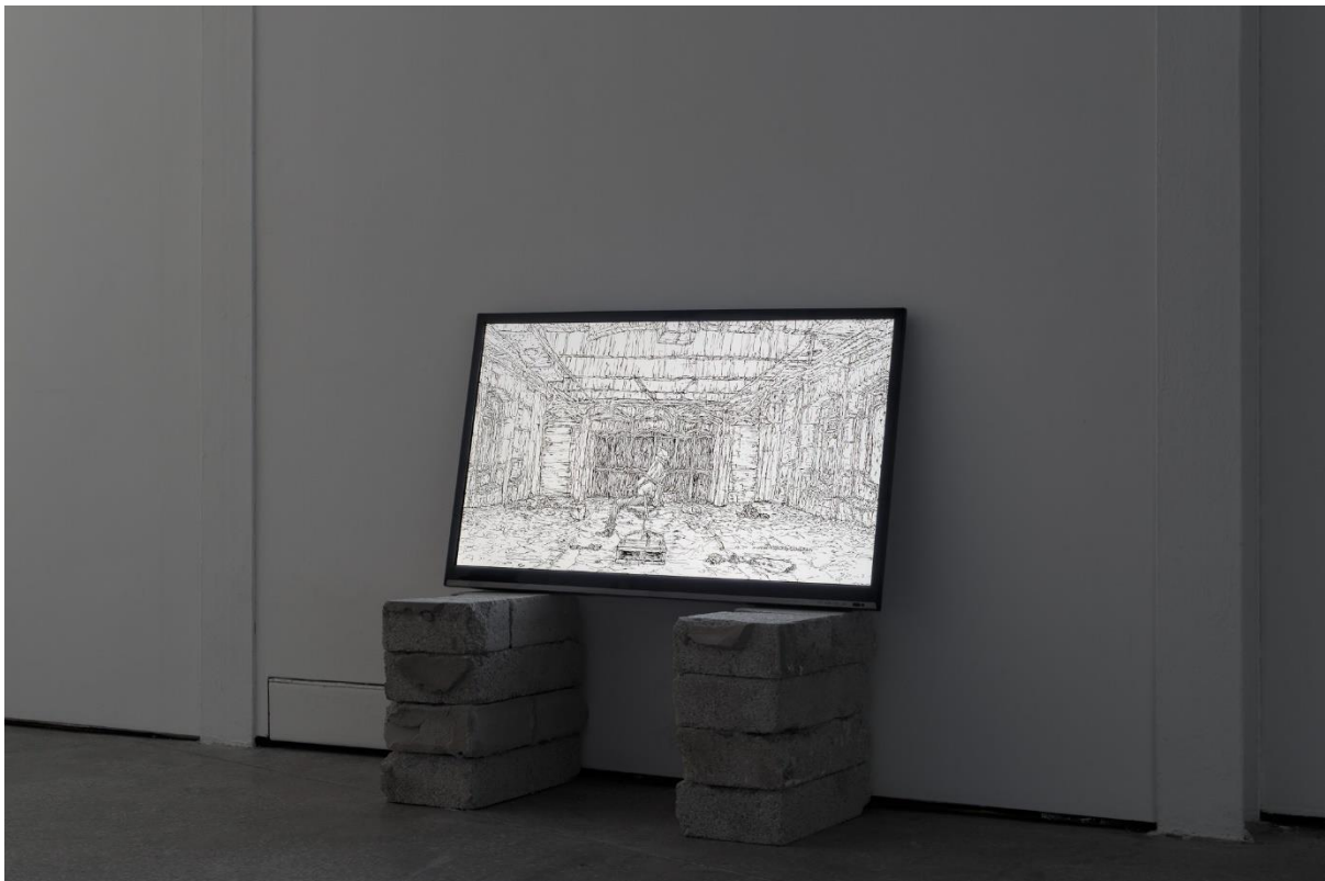
Comfort Falls, 2015, Animation, (1min 43sec)