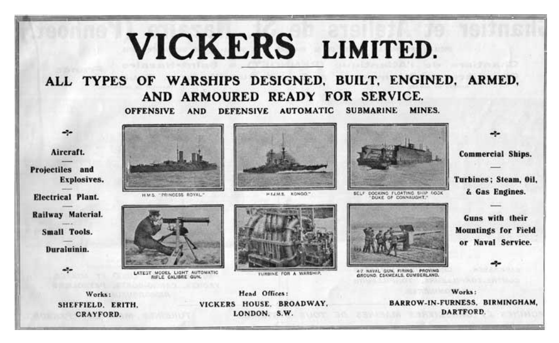
Figure 2 - Vickers 1914 Advert

By 1900 Vickers and Armstrong's had effectively supplanted the Royal Ordnance Works as the Admiralty's main suppliers of naval ordnance and gun mountings. Significantly Admiralty contracts for hydraulic gun mountings kept the Vickers engineering sections busy and in some years rivalled the contribution of submarines to Barrow's profits. It was partially due to Albert Vickers big naval gun ideas that by 1914 the firm had moved into a commanding market position. In the financial year 1913-14 out of a total of £643,000 spent on naval firepower by the Admiralty, some £302,925 went to Vickers. By the end of 1914, to expedite the contracts for naval guns and mountings, it had become necessary to engage other huge sheds in the vicinity of the docks. Further in the interest of working together economically and largely in expanding warship building capacity Vickers acquired a half share in William Beardmore's. In recognition of the private yards the Admiralty announced in 1906 'the first business of the Royal Dockyards is to keep the fleet in repair and the amount of new construction allocated to them should be subordinated to this consideration'. Notwithstanding, when Portsmouth dockyard constructed HMS Dreadnought in 1906 the