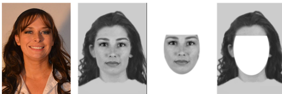
Fig. 1 Examples of target photograph, an example full face composite and the stimuli created for internal and external face parts (from left to right respectively)

Participants in the placebo-at-encoding conditions (conditions 1 and 3) received 450 ml of orange juice, with 2 ml of vodka dispersed on the surface of the drink, and the outside of the glass misted (three sprays) with vodka to create the smell of an alcoholic beverage. Participants were asked to consume their drink gradually over the course of 15 min, followed by 15 min rest before task commencement. Participants were offered magazines to read during this time.