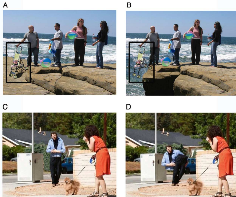
Figure 1. Example of social normal (A), social weird (B), perceptual normal (C) and perceptual weird (D) stimuli. The black square represents the target region. Note the black square is not visible during the experiment. 149x129mm (300 x 300 DPI)