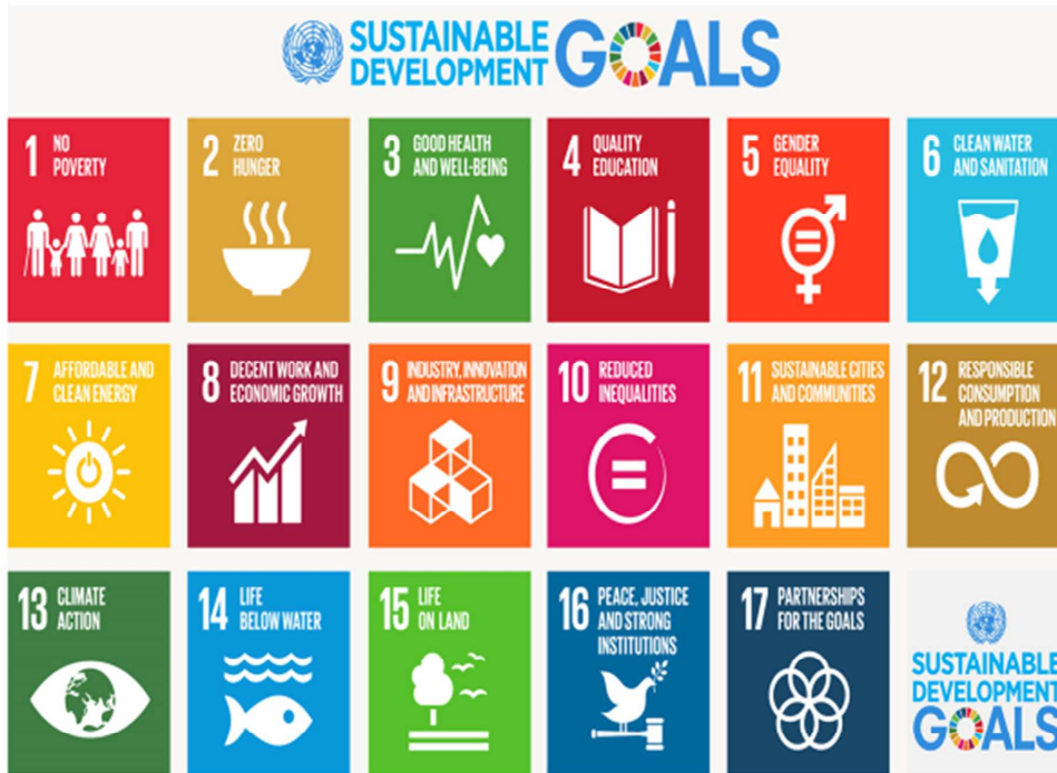
388 Figure 1: UN Graphical Illustration of the 17 SDGs And as a simple well-publicised 389 graphical table... 390 (high resolution version available directly from UN SDG sites): Figure 1