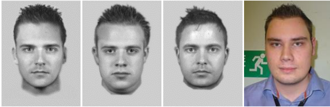
Figure 2. Example composites constructed from a holistic system of one of the targets (far right) used in the experiment. Each composite was produced by a different participant 22-26 hours after having watched a video of the target person giving directions to a local town centre. From left to right, the composite was produced without providing a description of the face (no-description), after freely recalling the face (description no-delay) and 30 minutes after free recall (description delay).