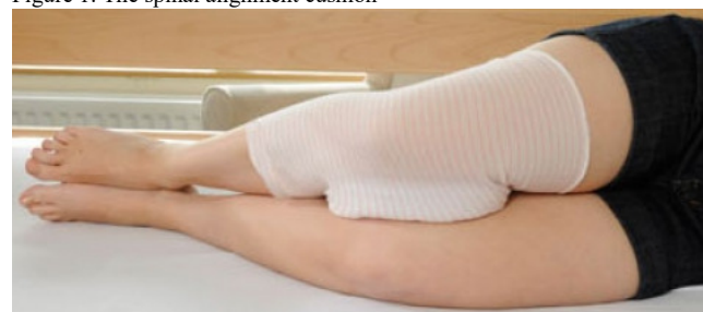
Figure 1. The spinal alignment cushion

important symptoms of LBP (17-19). Within a large prospective study of 482 LBP patients attending a back-pain triage clinic, 44% of the patients complained of some pain at night, of which 42% experienced pain every night (20). In addition, a highly significant relationship has been documented between sleep and pain levels, with 55% of LBP patients reporting restless/light sleep after the onset of