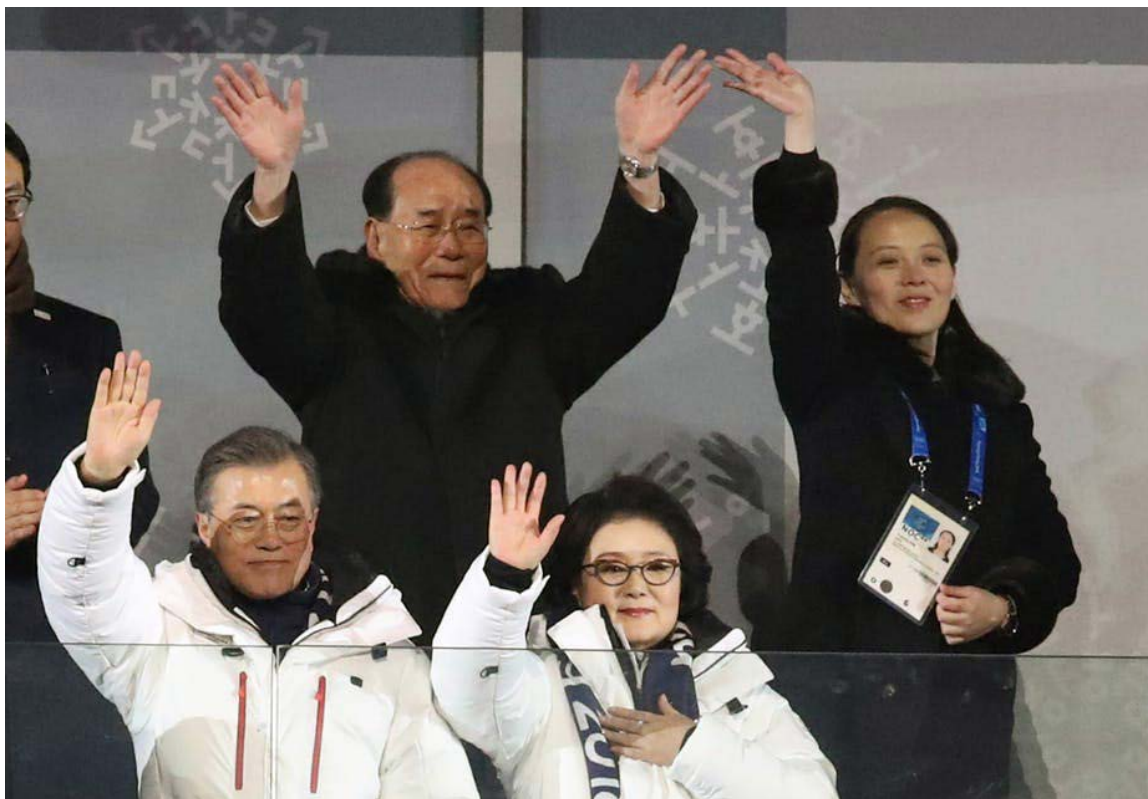
Come together: South Korea's president and first lady (front) with North Korea's head of state and Kim Jong-un's sister.