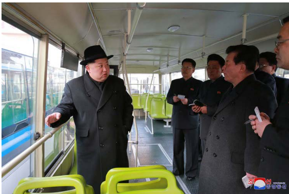
Kim Jong-un oversees a floundering economy.