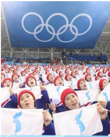
North Korean cheerleaders hold the Korean Unification Flag as they root for the South Korean ice hockey team.

The performance by the North Korean art troupe and the unified hockey team seem to demonstrate that North Korea is genuinely interested in improving relations with South Korea and building a collaborative relationship. And crucially, the events seem to have created a spirit of comradeship among everyday South Koreans.