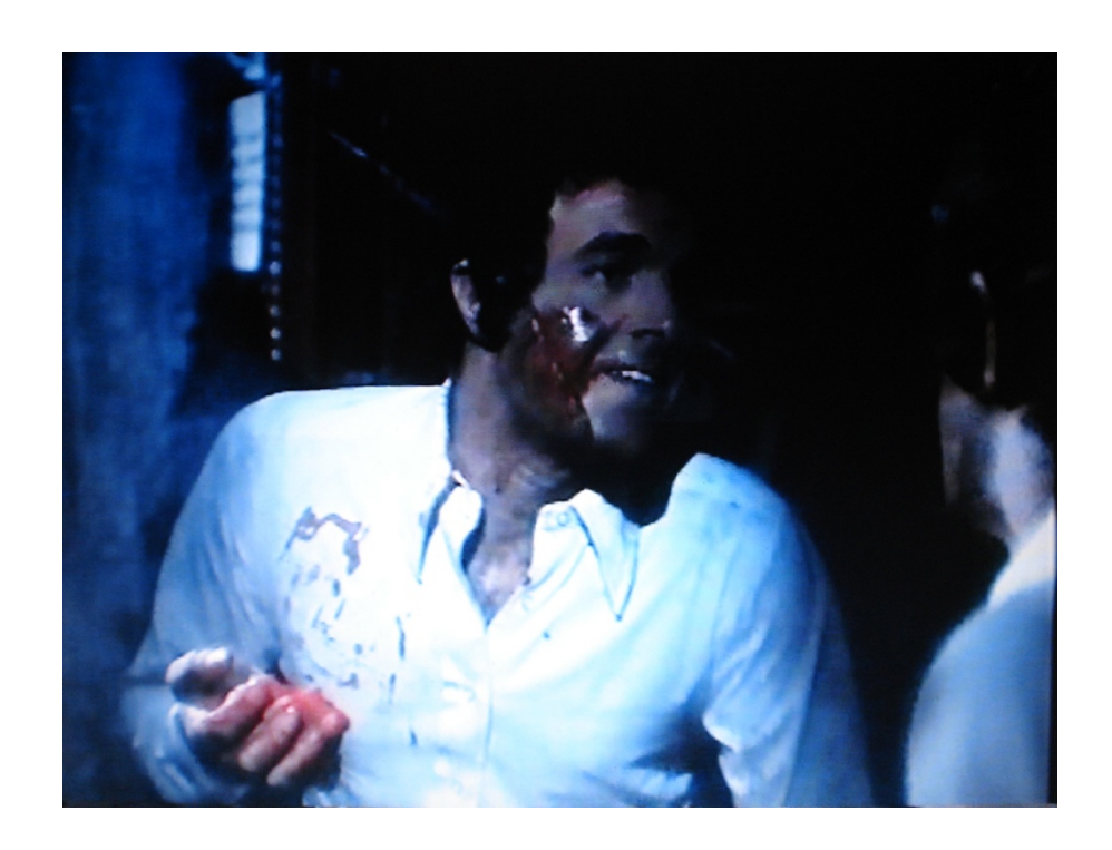
2. The final scene from The Gambler . Axel admires the wound that confirms his proximity to the real of chance