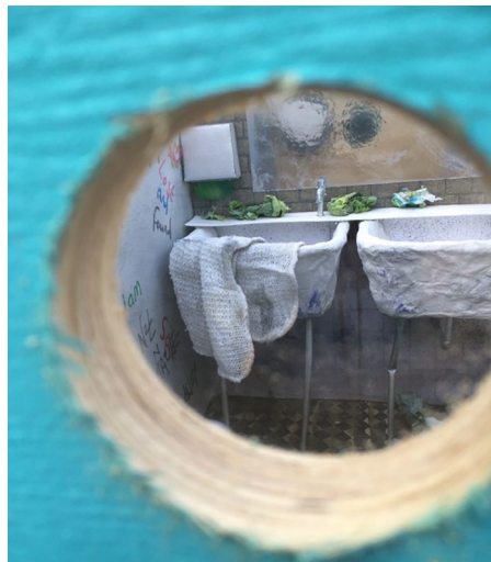
Figure 2. View inside.

how and by whom the footage would be edited and how and by whom the final film would be used or shared, something that reflected the fact that the project team were learning on the go (Gubrium et al., 2015). Furthermore, at the time, the PARTISPACE European consortium had not reached an agreement about how confidentiality or anonymity would be maintained and on what basis the films would be made publicly available. Thus, the project team deliberately focused on the film as a way of documenting the creation of the art installations and the walking tours rather than as a shared output.