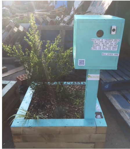
Figure 1. Box and planter.