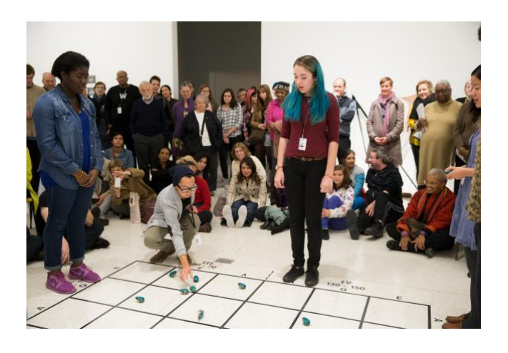
Figure 3: Benjamin Patterson (1962), Pond . Courtesy of Erin Smith for Walker Art Center, Minneapolis, USA

Benjamin Patterson distils the diffractive flux of schizopedagogic counter-waves into sound actions. His Variations for Double-Bass (c. 1962) is a demonstration comprising a series of "[p]itches, dynamics, durations, and number of sounds" (Patterson, c. 1962) that approaches the instrument's body without organs. The performer improvises Patterson's score, preparing the instrument with a sequence of objects—clamps, clips, pegs, and paper strips, etc.—plucking, bowing, rubbing, or agitating it to examine the double-bass's sonic potential. Patterson set out to become "the first black to 'break the color-barrier' in an American symphony orchestra" (2012, p. 110), but upon meeting John Cage and David Tudor in 1960, he shifted focus towards experimental practice and became central to the formation of Fluxus in 1962.