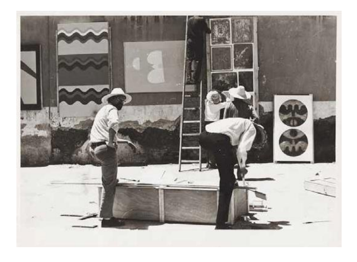
Figure 2: Exposition-Manifeste/Présence Plastique, Place Jemaa el-Fna, Marrakech, 1969.

Deleuze and Guattari align the insights of this moment with the capacity of capitalist desiring production to fragment and recouple. "No one has ever died from contradictions. And the more it breaks down, the more it schizophrenizes" (1994, p. 151). Deleuze and Guattari argue racialisation integrates non-white indigenous populations as a divergence from the generalised schema of the White-Man face whose model is the image of Christ. All faces are constructs, intersections of signification (white wall) and subjectivity (black hole). "From the viewpoint of racism, there is no exterior, there are no people on the outside. There are only people who should look like us and whose crime it is not to be" (2007, p. 197). Racialisation is an interplay (rhythm) of polyvocal subjectifying forces, or pulsating "backward waves" (p. 197), subject to binary organisation upon the facialisation machine. The counteraction of de-facialisation returns subjectivity to an experimental state and reterritorialises a "new set of artifices" (p. 193). Deformations of facialisation scramble the binary parameters of white (superior) and non-white (inferior) identity, delegitimising colonial ideologies, creating space for the formation of postcolonial nationalities.