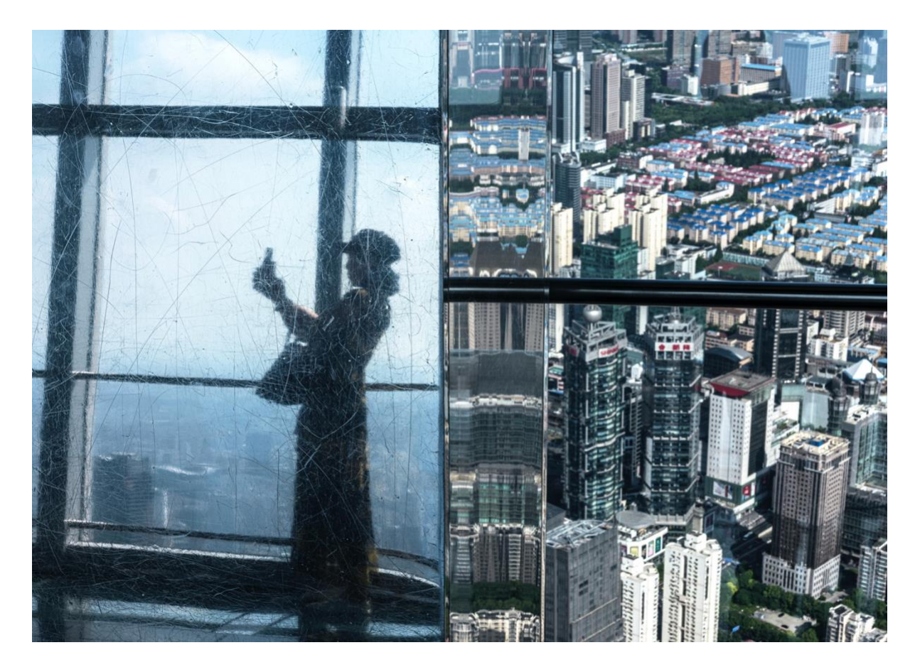
Fig. 2. Observation Deck, 2020.