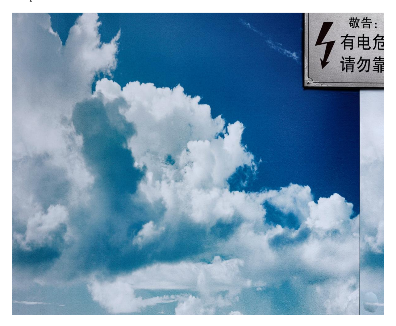
Fig. 3. Clouds, 2020. Credit: John van Aitken & Jane Brake.

We started to question the atmospheric qualities of photographs used to promote Shanghai's Pudong district. We must note something probably obvious: that having a blue sky is not just, or maybe not even at all, about the weather conditions in the environment. When we look at a selection of Pudong photographs we should not imagine we are looking at a representative sample of skies, but at the atmospheres that are chosen, the ones we admire or are prepared to accept.