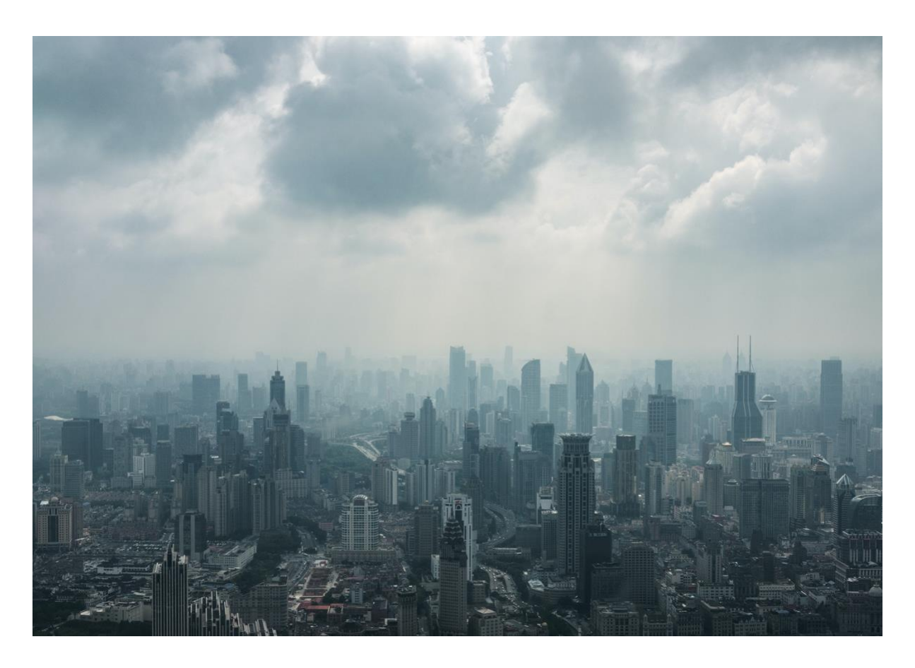
Fig. 1. Shanghai, 2020.