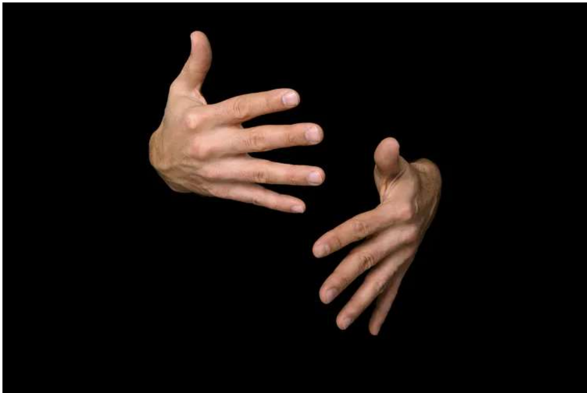
A lack of understanding of British Sign Language among prison staff carries the danger of treating signing as problematic.

It's also common for imprisoned people to use social interaction and engagement with other prisoners to make prison life more manageable. Yet a lack of access to hearing aids can also lead deaf prisoners to withdraw.