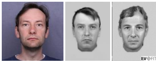
Figure 1. Example target and composites (left from a participant in the Control group and right from a participant in the focused breathing group).

2.3.2. EvoFIT Construction Procedure. Detailed procedures for face construction using EvoFIT are described in [14]. In brief, participants selected an appropriately aged gender and age database. They then were asked to select from whole-face arrays, thought to be more relevant in familiar face recognition thus potentially helping to increase composite identification accuracy [4]. These witnesses were instructed to ignore the width of the face, as that aspect of the face could be finalised later, but to make selections based on the upper half of the face, since this procedure should promote an identifiable face. They selected items (presented as internal-features) for smooth faces, textured faces and combinations thereof. Once two complete iterations had been carried out, the witness manipulated the whole face for the overall or ‘holistic’ properties of the face (for age, weight, pleasantness and 12 other global scales) as well as adjusting the shape and position of features; when done, the external features (e.g., hair, ears, neck) were added. Following any further adjustments to holistic or shape properties, the face was saved to disk as the facial composite; see Figure 1 for examples. Participants in the experimental condition were asked to take a single focused breath prior to looking at each EvoFIT screen. The cognitive interview and composite session took about an hour to complete per person.