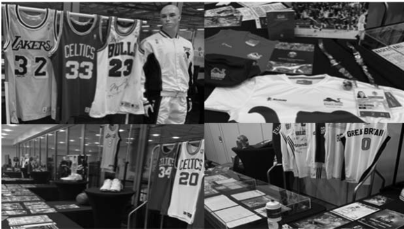
Figure 1. Collation of images from the NBHC exhibit, January 31st, 2020.

Although designed to be temporary (due to the current lack of space for permanent displays and short term use of loaned material), the exhibition success has, invariably, been enabled and enhanced by NBHC's clear, concise, and consistent virtual identity. Firstly, NBHC required an acceptable name that could effectively communicate the Centre's brand and be employed across multiple social media spaces. Initially, the URLs NBHC.com and NBHC.org were available but were premium domain names priced beyond the Centre's financial resources. 34 In the social media space, @BasketballHeritage exceeded Twitter's character limit, so the word basketball was replaced with hoops ; a popular slang term for the sport. 35 The Centre eventually settled on www.HoopsHeritage.com for its domain name, @Hoops.Heritage for Facebook, Instagram, and TikTok, and @Hoops_Heritage for Twitter. With significant image and video-based content, currently NBHC disseminates primarily from Instagram with posts simultaneously synchronised with Facebook and Twitter.