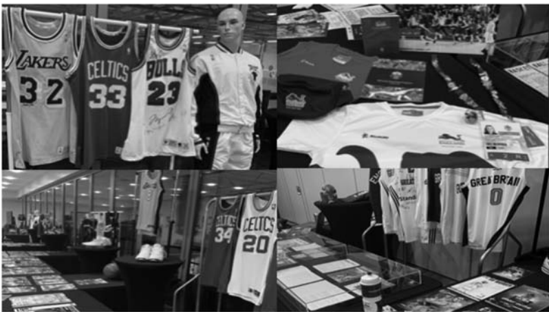
Figure 1. Collation of images from the NBHC exhibit, January 31st, 2020.

Although designed to be temporary (due to the current lack of space for permanent displays and short term use of loaned material), the exhibition success has, invariably, been enabled and enhanced by NBHC's clear, concise, and consistent virtual identity. Firstly, NBHC required an acceptable name that could effectively communicate the Centre's brand and be employed across multiple social media spaces. Initially, the URLs NBHC.com and NBHC.org were available but were premium domain names priced beyond the Centre's financial resources. 34 In the social media space, @BasketballHeritage exceeded Twitter's character limit, so the word basketball was replaced with hoops ; a popular slang term for the sport. 35 The Centre eventually settled on www.HoopsHeritage.com for its domain name, @Hoops.Heritage for Facebook, Instagram, and TikTok, and @Hoops_Heritage for Twitter. With significant image and video-based content, currently NBHC disseminates primarily from Instagram with posts simultaneously synchronised with Facebook and Twitter.