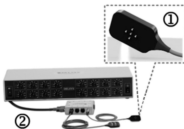
Figure 2. dEMG sensor (1); Delsys Bagnoli amplifier (2).

Surface EMG data were collected using the Delsys dEMG system (Delsys Inc., USA). The dEMG system (Figure 2) consisted of a 16-channel amplifier and a 4-channel EMG electrode (dEMG sensor, Delsys Inc., MA, USA). The EMG signals were sampled at 2 kHz with a gain of 1000 and band-pass filtered (20–450 Hz) through a Delsys Bagnoli amplifier and NI USB 6251 DAQ (National Instruments, TX, USA). The dEMG sensor consisted of five cylindrical blunt-ended pins 0.5 mm in diameter, with an interelectrode spacing of 5 mm, providing 4 channels of surface EMG data. The dEMG sensor was taped in place over the surface of the FDI muscle after the skin was prepared by cleansing using an alcohol swab and moistening with a dilute saline solution. Initially, participants were asked to perform a maximum contraction pushing their index finger against a rigidly mounted force sensor for approximately 3 s; they were then allowed to rest for 2 min. They were then asked to perform 3 repetitions of a 30 s contraction at 30% of their maximum following a trapezoid force biofeedback channel. This comprised of a quiescent period, a 3 s ramp up period, a 30 s isometric hold, a 3 s ramp down period, and a final quiescent period with a 2 min rest between repetitions, the dEMG sensor remained attached to the subject for the duration of the experiment.