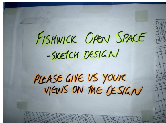
Figure 1. Existing attempts to encourage feedback were evident around the community.

Opinions on traditional forms of consultation and participation proved to be generally negative. Although some residents reported voting regularly, others displayed disillusion with the political process and a low sense of self-efficacy: residents generally felt that their input had no effect and their voices were ignored. As a disadvantaged area, residents were regularly consulted on many local issues but rarely saw any action taken as a result of their input, causing “consultation fatigue”. The councillors and housing associations identified the importance of gathering feedback from members of the public and felt that the device could potentially help with this. There had been many existing attempts to engage the residents in