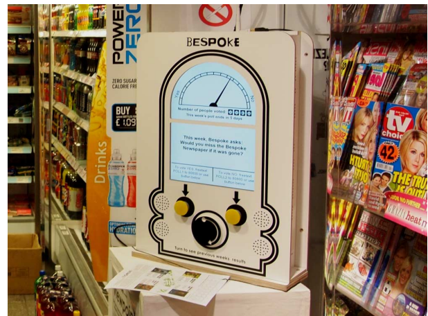
Figure 3. Viewpoint deployed in a local shop.

Feedback on the prototype itself was more critical, and much of this criticism related to the method of interaction. Although most residents owned a mobile phone, many older residents were not able to send text messages and some users needed to be coached to send their votes to the device. Furthermore, even those who were comfortable with text messaging felt that it was more suitable for remote interaction and that using text messages to communicate with a collocated device was unusual. Several users independently suggested that the device could have voting