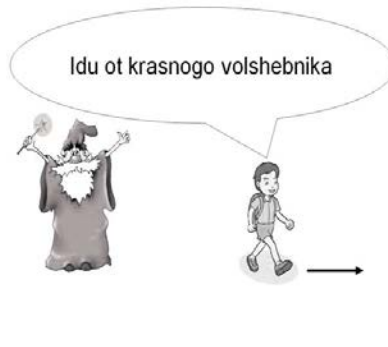
Figure 1 A sample training slide.