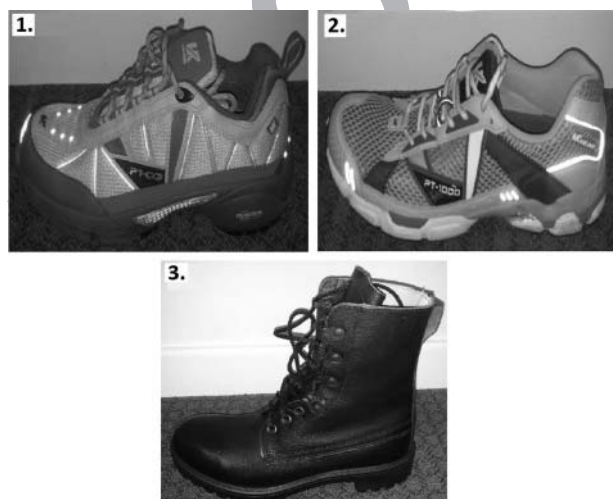
Figure 1. Footwear used in this study: (1) cross-trainer, (2) running shoe, and (3) military boot.

The robustness of the biomechanical model was examined by conducting a sensitivity analysis. This was undertaken by calculating PTCF and PTCP values when individually varying the two key input parameters KFA and KEM from their minimum to maximum value. Sensitivity index values were calculated in accordance with Hamby (1994) and showed values for PTCF of 0.18 and 0.19 B.W and for PTCP of 0.15 and 0.19 MPa as a function of KFA and KEM scores, respectively.