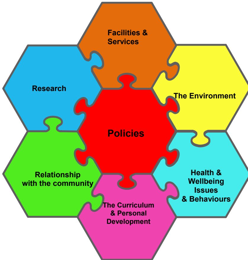
Figure 1: The Healthy University Model