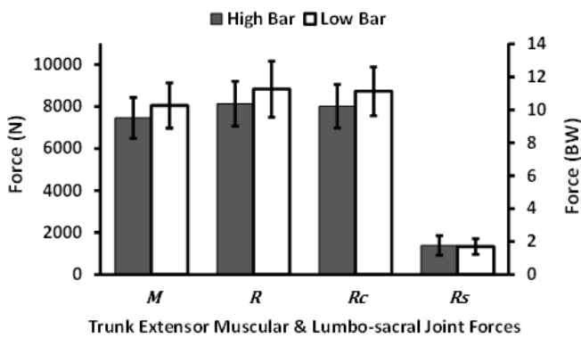
Figure 4: Mean ± SD muscular and joint forces at the lower back.