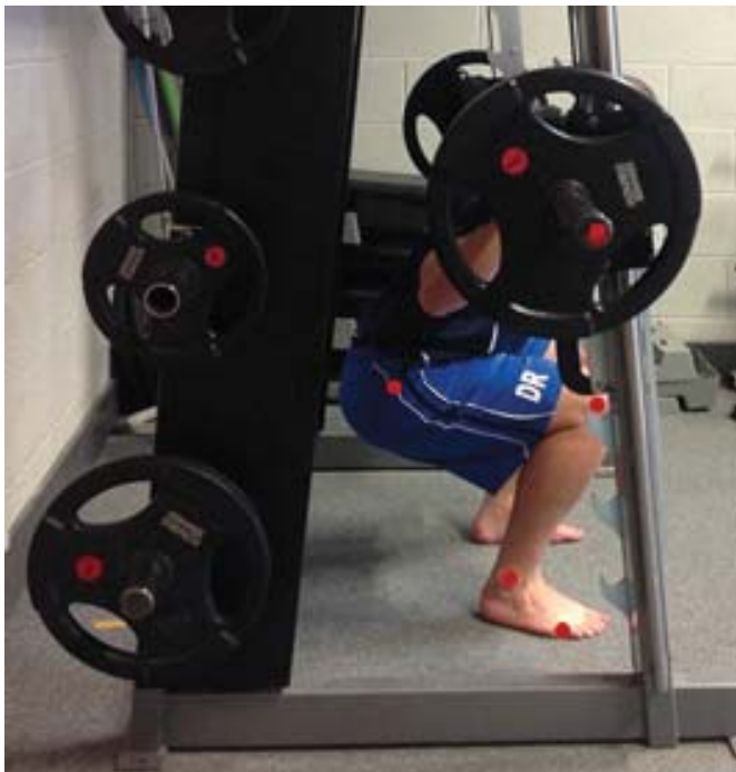
Figure 1: Definition of the 'bottom of the squat' with the thighs approximately parallel to the ground

The technical model illustrated by Baechle and Earle 2 was adopted in the present study to standardise the squatting technique of the participants 4 . The high bar and low bar squats were performed on a LifeFitness Hammer Strength 7 backward-inclined Smith machine. The backward-inclined type of Smith machine was selected due to being a ubiquitous system in many strength training venues 7,12,13,18 . The participants' 1RM was established two days prior to the test using the high bar free squat technique, since the participants stated that they were accustomed to establishing their 1RM using the high bar free squat. The 1RM was determined using the direct method 4,19 . Specifically, the direct method protocol involved 2 to 3 warm-up sets and then 2 to 3 working sets 5,13,20 . The working sets consisted of choosing a weight that the participants thought they could lift for 1RM 21 , whereby the chosen weight was adjusted throughout these sets to determine the maximum lifting capability. The mean \pm SD 1RM load was 100.3 \pm 7.2 kg ( 1.25 \pm 0.09 BW). The warm up protocol and execution of the squat movements on the day of data collection are reported previously 4 .