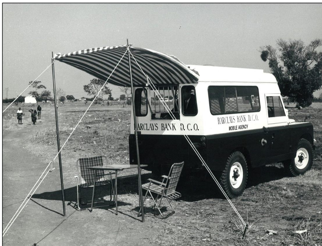
Fig. 6. Zambia mobile branch pictured in 1967

Generally speaking, the DCO/BBI archive is under-used. This article has barely skimmed the surface of the rich and varied material it contains. It has relevance far beyond the world of banking, and can tell us a huge amount about the territories in which Barclays operated, and the British attitude towards them during a time of immense change. Barclays invites more researchers to make use of these untapped riches.