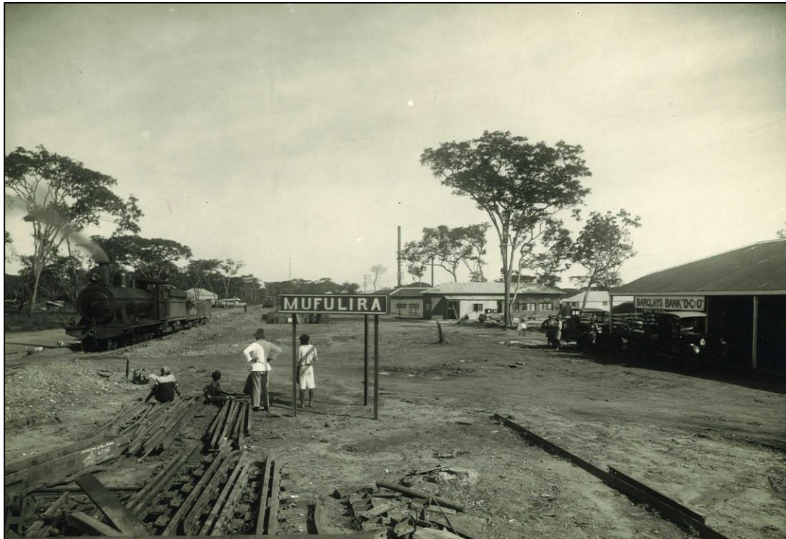
Fig. 3 Mufulira Branch in Northern Rhodesia's copperbelt in the 1930s.