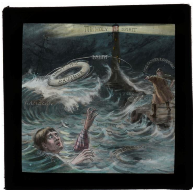
Figure 1 makes explicit the interventionist role which members of the total abstinence, or 'teetotal' movement were expected to fulfil with respect to alcohol. This magic lantern slide, part of a flexible Victorian technology which was widely

drink as so powerful and volatile that a single drink may put one on the road to the hospital, the poorhouse or the jail. Therefore, the argument goes, the only way to avoid risk is to avoid drink entirely. Risk avoidance, therefore, was at the heart of teetotalism and the agents for encouraging risk prevention were often children. Many temperance organisations were closely linked with Christian belief or set up under the auspices of religious groups, and moral responsibility was also appealed to, as well as enlightened self-interest. It is as well to remember that deeper resonances operated after formal links with religion had begun to decay; as Iain Wilkinson remarks, 'Within a secularized cosmology, risk adopts the traditional mantle of sin' (2001: 4). In the material which this paper considers, the risks which alcohol could present were frequently and uncompromisingly linked with sin, which individuals and society were shown as having a duty to oppose.