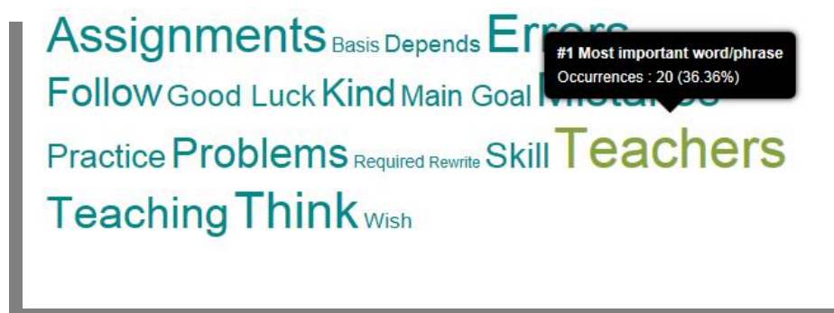
Figure 2. Text analysis and thematic representation of word frequencies in question 15 using NVivo® software.

There were 81 comments in total, which mainly focussed on two main areas: teachers and errors. This was obtained using the text-analysis software, NVivo® where initially, the data was queried into word frequency distributions and tag clouds. The analysis gave a thematic word frequency as well as a percentage of occurrences in the participants' comments (Figure 2).