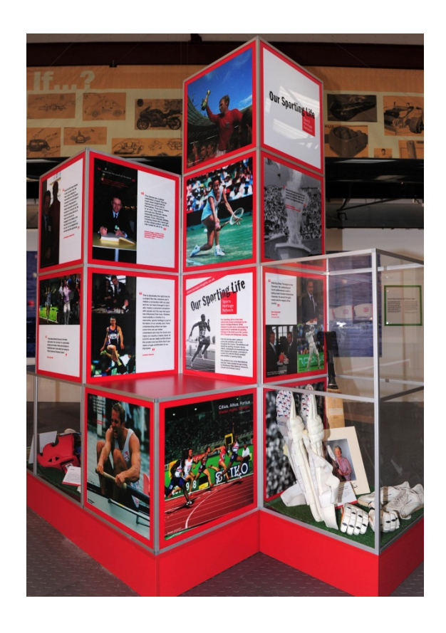
Figure 1: Our Sporting Life exhibition cubes, Ironbridge

Our Sporting Life was funded by the MLA for a period of twelve months to the value of £100,000, which financed the initial set-up costs and a project manager to oversee the initial delivery. By the beginning of 2012, however, the money ran out and the project manager left just as exhibition activity increased nationally. Consequently, the partnerships and contacts developed by the project manager could no longer be sustained and coordination of the project became difficult, with some partners withdrawing, and others hosting exhibitions without notifying the central Our Sporting Life team.