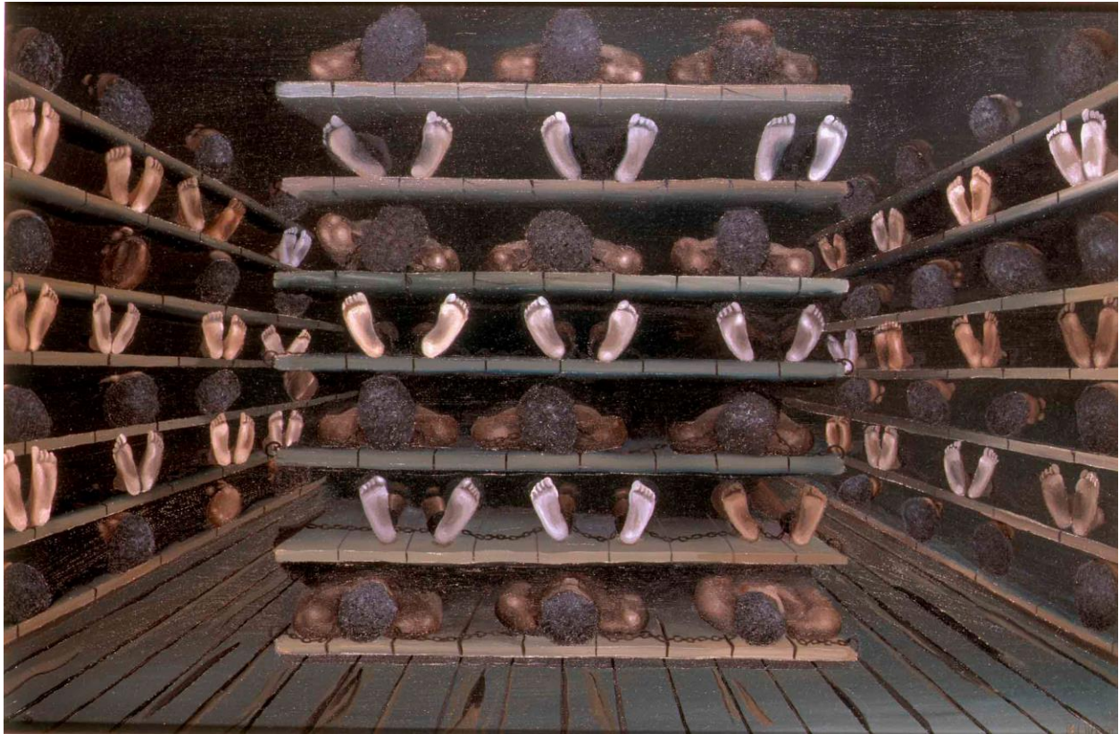
Figure 3. Slaves stacked up in the ship's hold ( Sheol by Rod Brown)

The picture of the ship's hold (Figure 3) in the exhibition was an image that caught the attention of participants in the workshops.