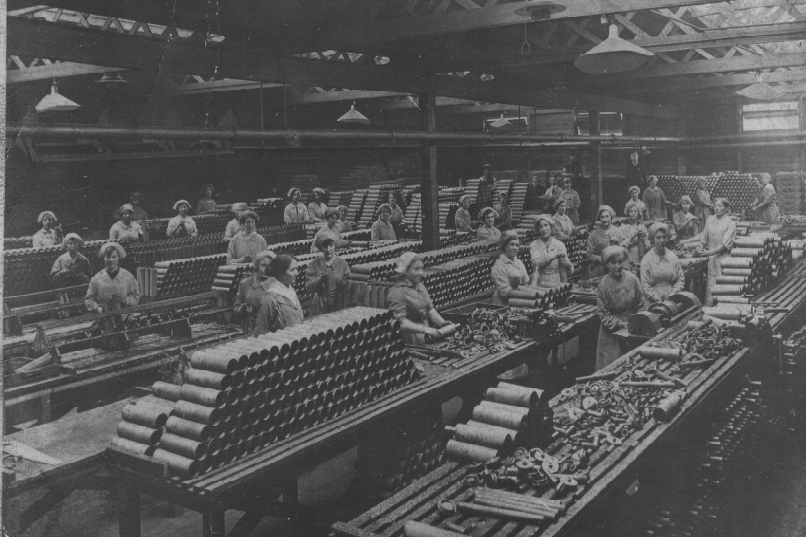
Artillery shell production, the Globe works of John Spencer Ltd., Wednesbury.

rose from 212,000 in 1914 to 819,000 by 1917, with overall female employment increasing from 5,966,000 in 1914 to 7,311,000 in 1918. 49