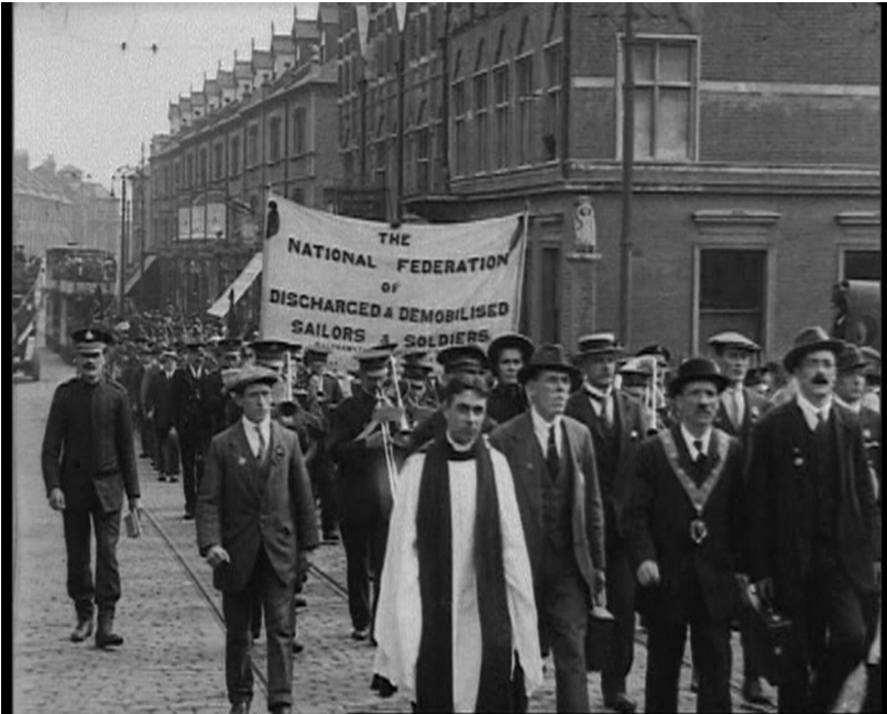
Ex-servicemen marching to a Drumhead memorial service at Walthamstow, 1919, led by a priest and civic dignitaries. The bus at the rear is probably providing transport for disabled men.

up. 8 Its members marched in “well-dressed fours” to a rally at Trafalgar Square, addressed by MPs James Hogge and William Pringle. 9 They wore red, white and blue rosettes, and the ex-servicemen’s silver badge “for services rendered to King and Empire”. 10 They carried a banner reading “Comb them out of funk-holes and the discharged men will go again. Gott strafe the Cuthberts” 11 – “combing-out” meant finding further military