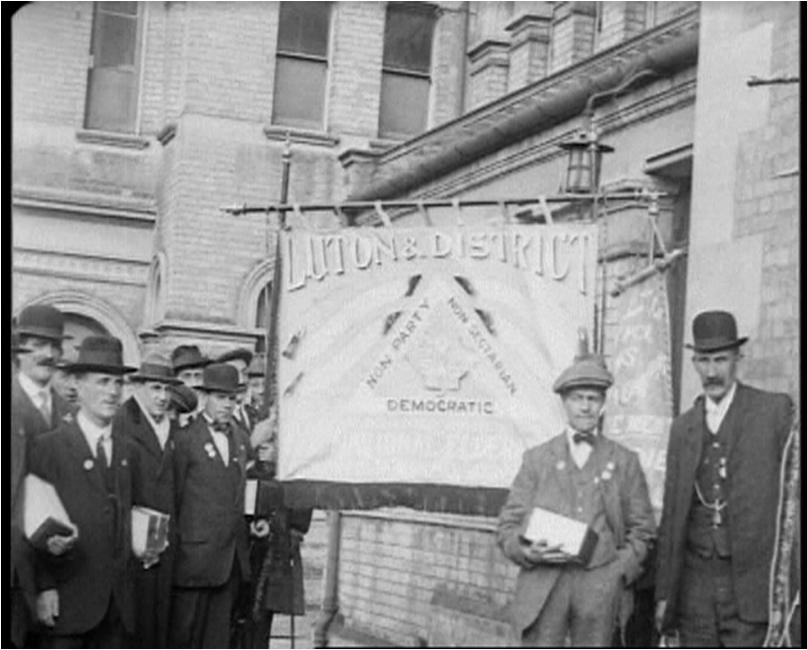
Men stand with collection boxes and the Luton Federation banner. Church parade, 1919.