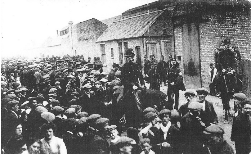
Demonstration outside of works, Walsall – The 1913 Black Country Strike, Wednesbury.

“distinguished chiefly by characteristics of insularity and intellectual submissiveness”. 10 The history of the Workers’ Union cites a local official’s exasperated comments that “the Black Country temperament does not incline towards organization; several people have broken their hearts over fruitless labour for the bringing together of the workers into the various unions”. 11