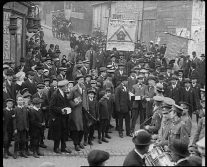
A church parade at Luton, 1919. Members of the Federation of Discharged and Demobilized Sailors and Soldiers march with banners, followed by a wagon carrying men who cannot walk. The marchers are met by serving soldiers, children, and men carrying collection boxes in aid of the families of dead veterans.