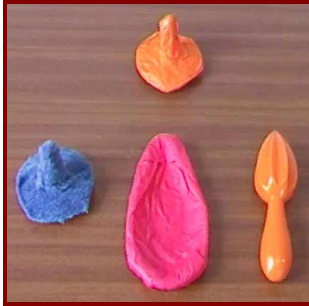
Fig 1 top