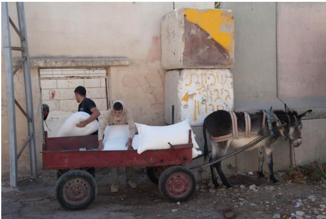
Figure 5: Three Palestinian men unload food from a donkey drawn cart, November 2013.

In the Palestinian city of Hebron, as is the case across the Occupied Territories, the relationship between politics and the distribution of sovereign power are negotiated on a daily basis. With this comes the question of visibility, representation and frame, because as Mieke Bal notes, seeing is innately political (2003). Thus, the visibility of the occupation is contingent on how political action is framed and translated into images. Anti-occupation practices are thus dependent on making visible what is not commonly seen.