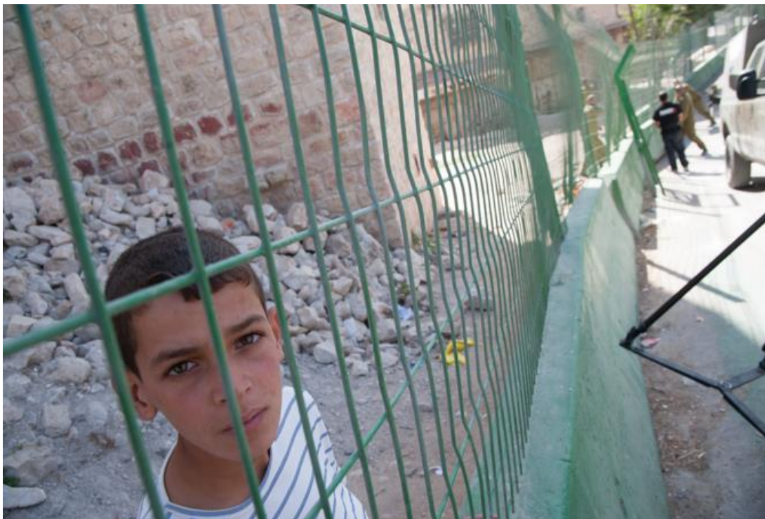
Figure 3: Activestills: Palestinian boy looks through a barrier dividing one of

Hebron and those who document the effect of the Israeli occupation in each space, all representation and experience will vary. While Gaza is under siege, the fragmentation of the West Bank through the settlement enterprise and related infrastructure to accommodate the Israeli settlers produced a different form of control over the space as much as it effects the visual representation of the occupation. As Eric Hazan writes, the case of Hebron is absurd and must be seen to be fully understood (2007). Activestills, either as a group or as individual members, have through their practice sought to make this absurdity visible. The collective negotiate a role whereby they work as news photographers selling their images to agencies that represent particular events, but more often each member operates as a documentary photographer and also an activist. Seeing a tangible relationship between the two roles each member returns again, and again to a particular place, operating above all with the aim of contributing to their own archive of photographs that builds a nuanced picture of the occupation.