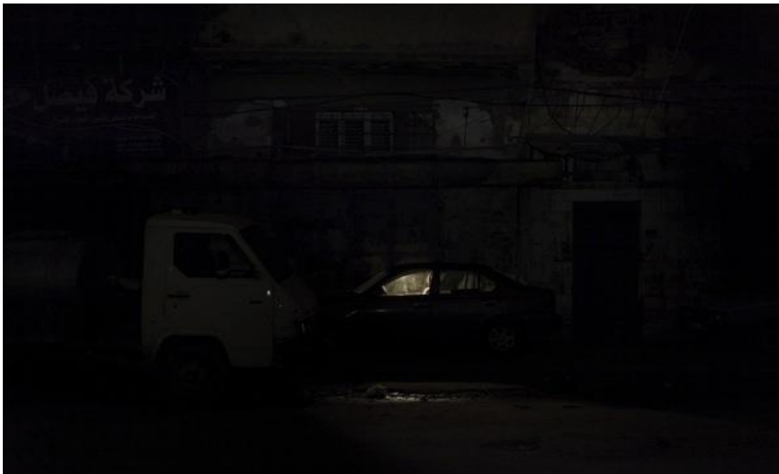
Figure 2: Gianluca Panella: 2013 A Gazan street, the only light is from the inside of a car.

democratic' spaces are repeatedly mediated to the point of visual exhaustion and juxtaposed with 'tribalistic displays' of public mourning and calls for revenge, Panella's images make apparent, through a visual strategy that effectively denies vision, how for Gazans the basic necessities of daily life are endlessly tied to the politics of life under occupation; fuel represents one of the most fundamental examples of this entanglement.