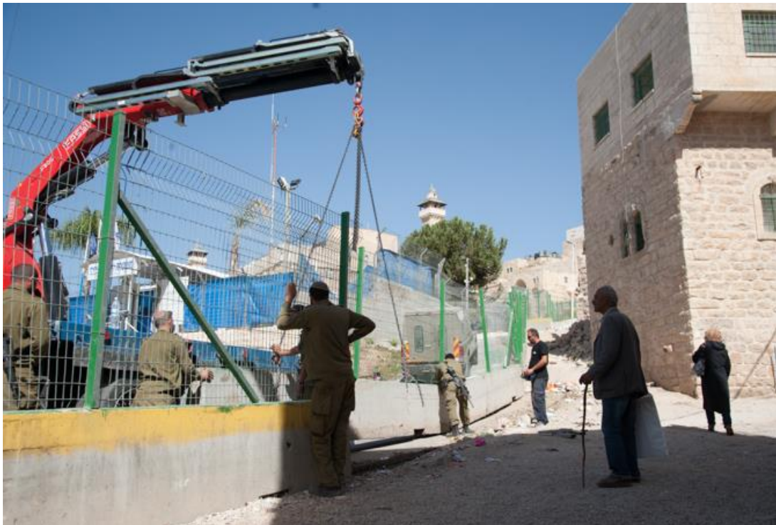
Figure 4: Activestills: An old Palestinian man watches on as IDF personal cut off what was previously Palestinian road with an 8ft high metal and concrete boundary, November 2013.

outbreak of the Second intifada, the Old City, the commercial centre and the service routes via the north–south traffic artery are still today out of bounds for Palestinian residents. Restrictions on Palestinian movement are mapped by a constellation of staffed checkpoints and physical roadblocks. In August 2005, the OCHA counted 101 physical obstructions of different kinds in H-2 (Feuerstein, 2007: 20). The most notable and documented act of boundary manipulation was the forced closure of Hebron’s main commercial centre, Shuhada Street, reducing the city centre into a ghost town.