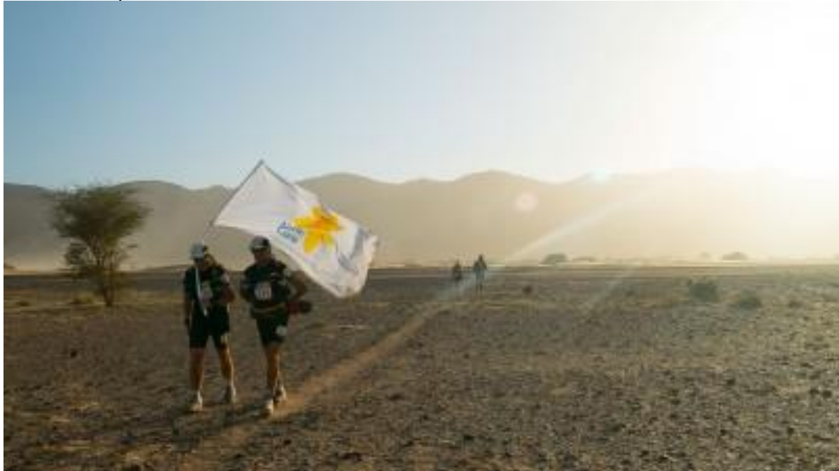
Figure 2 Sir Ranulph Fiennes competing in the Marathon des Sable.

sought to understand how Glass functioned in a time-pressured, multifaceted and multimedia production workflow in extreme conditions.