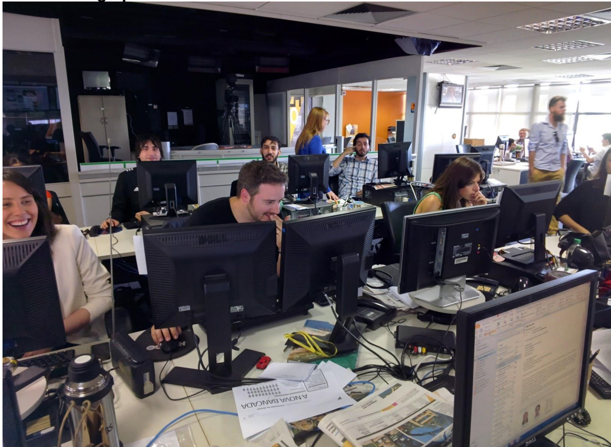
Figure 3: Zero Hora newsroom, Porto Alegre

The picture above, taken by Glass in the Zero Hora newsroom, is one sample of a normal routine day in the Porto Alegre hub. Many shots like this was taken during the trial, and they represent an internal picture of the newsmaking process. This image could point to an important way to use wearables like Google Glass within journalistic and other industry contexts. These devices could act like a tool to research the ambient using ethnographic methodologies. We can identify on the pictures journalists' moods and change on density in certain parts of the room. This is different than take photos with a regular camera or smartphone, because it occurs more covertly.