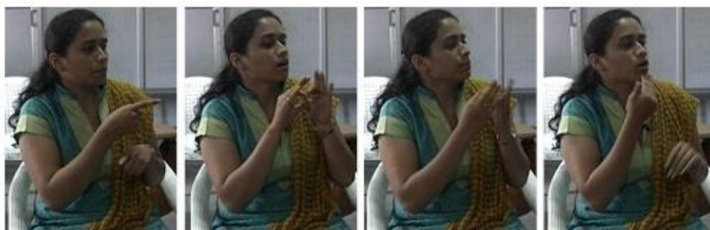
IX:2 FAMILY FAMILY STU- jese aap eh family family men in aur also like you.HON family in

(11) IX2 FAMILY FAMILY SCHOOL GROW-UP EXPERIENCE DEM:3pl jaise aap eh family men aur kaun kaun hain aap -ke like you.HON family in also who who COP.PRS.3PL you.HON-POSS.2PL “In your family, who else has experiences with schooling/education?” (ISL) “Like, who else is in your family?” (Hindi) See Figure 7