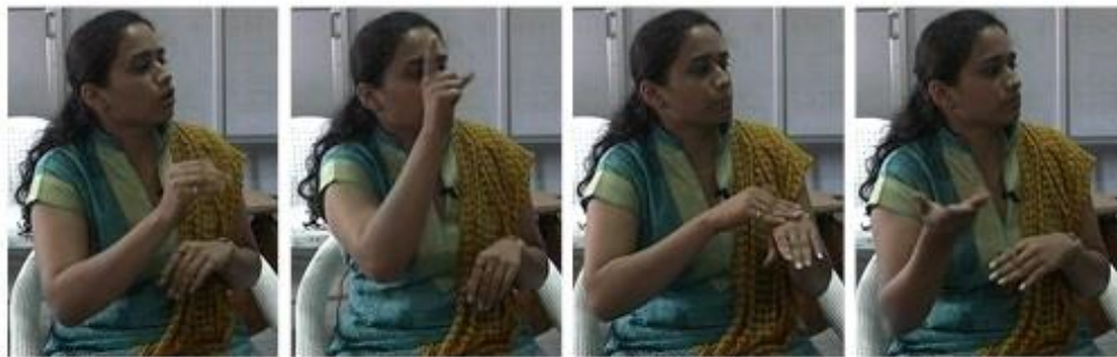
DENT IX:up EXPERIENCE DEM:3 kaun kaun hain aap -ke who who COP.PRS.3PL you.HON-POSS.2PL

“In your family, who else has experiences with schooling/education?” (ISL) “Like, who else is in your family?” (Hindi)