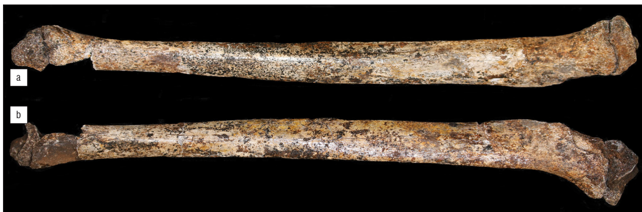
Figure 2: Patterns of mineral staining affecting tibia U.W. 101-1070. Note differential mineral staining patterns between conjoined fragments at the distal end.

In addition to lichen, Thackeray suggests 1(p.5) that snails and beetles could indicate the presence of leaf litter (on which they feed), which would be found near the cave entrance and therefore in a situation with diffuse light. However, as noted by Dirks and colleagues 13 , snails have been recognised to colonise dark caves to considerable depth 17 , and are far from restricted in diet to just plant matter 18 . Gulella sp. and Euonyma varia (Connolly, 1910) occur in large numbers in the Rising Star Cave system, including in deep chambers in the dark zone, and may well be responsible for some of the bone surface modifications on the fossils. Subulinid snails (including Euonyma ) are largely omnivorous and are thus not dependent on green plant material as a food source (Herbert D 2016, personal communication, January 28), while Gulella spp. are carnivorous and feed mostly on other snails. 18