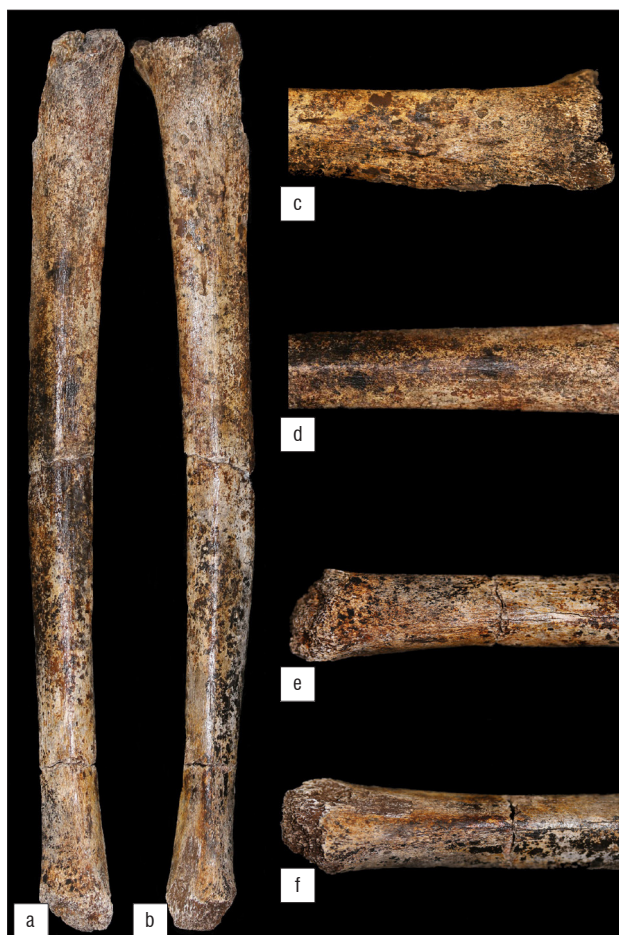
(a) Medial aspect; (b) lateral aspect; (c) close-up of anterior shaft; (d) mid shaft; (e) close-up of distal end seen in (a); (f) close-up of distal end seen in (b).

However, the distribution of Mn staining is not only on this one side of the specimen, but on all anatomical sides (anterior, posterior, medial and lateral), as shown in Figure 1. Such a distribution can also be seen on many specimens (for example, in Figure 2, specimen U.W. 101-1070, correctly attributed here). The distribution of Mn staining on the Dinaledi Chamber material is generally circumferential, occurring on multiple sides of bones. That distribution is not compatible with lichen growth in the present context, and there are significant reasons to reject the hypothesis that the Dinaledi Chamber is a secondary deposit. 2,13