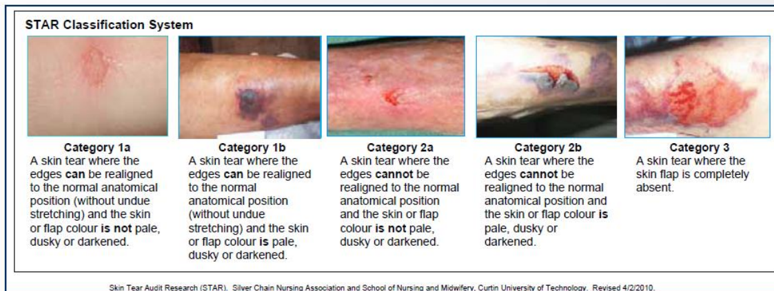
Figure 3. STAR classification