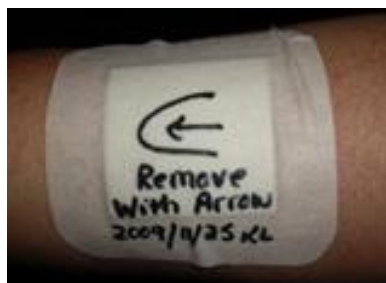
Figure 3 From Le Blanc et al

If a patient presents with a dressing in place, it is important to try and establish the direction of the flap in order to remove the dressing in the least traumatic way. Health care professionals should be encouraged to either document or use a directional arrow on the dressing itself to indicate the direction of the flap and the best way to remove the dressing (see Figure 3 Figure 3 to be reproduced by EN).