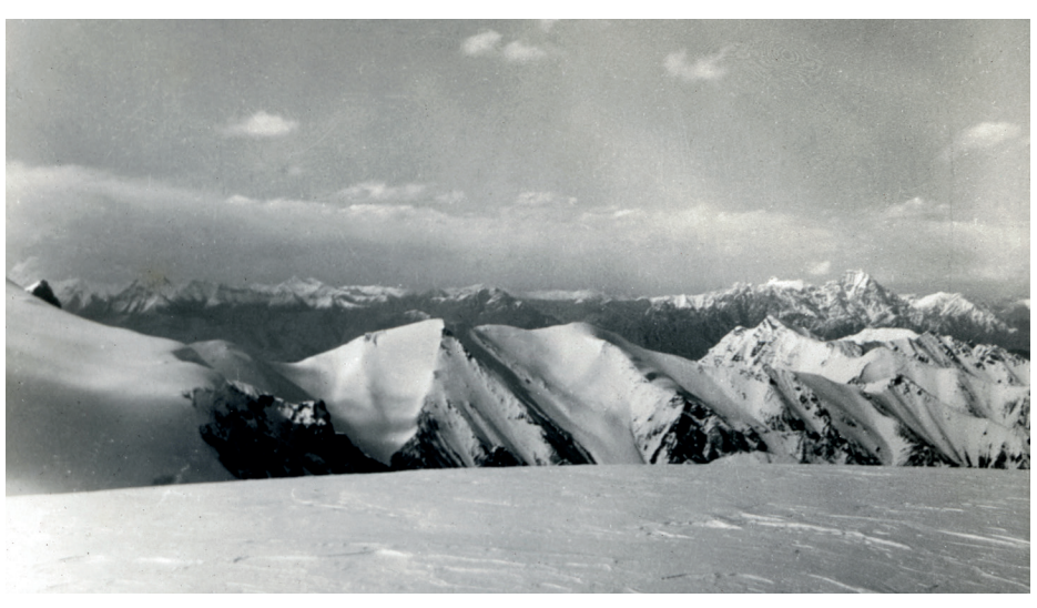
Kun Lun from the Aghil Pass.