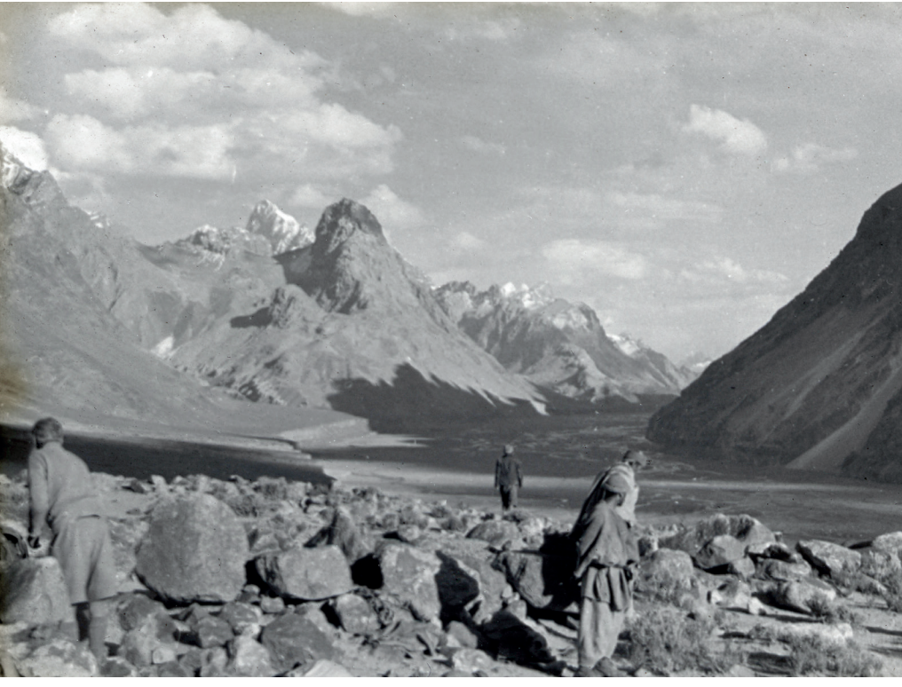
The Shaksgam valley.

What are we to make then of Shipton's promise not to go north into Chinese territory? Clearly the British Indian state increasingly problematized its geographical intelligence deficits in the Shaksgam and stood to gain by this purposeful infringement into the un-demarcated border region. Menon in his letter to Shipton of 22 September 1936 had only advised Shipton not to 'travel beyond the mountain regions into undisputed Chinese territory', which would require the acquisition of Chinese passports and