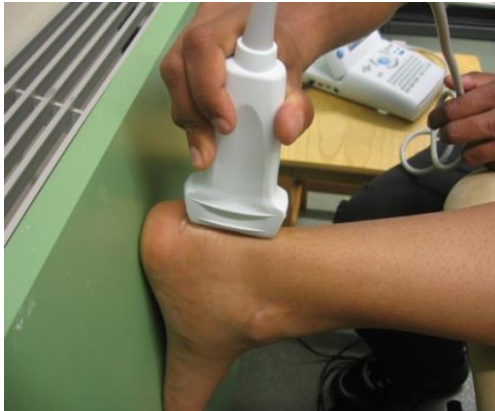
Figure 3: Positioning of the transducer.