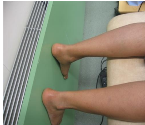
Figure 2: Participant positioning.