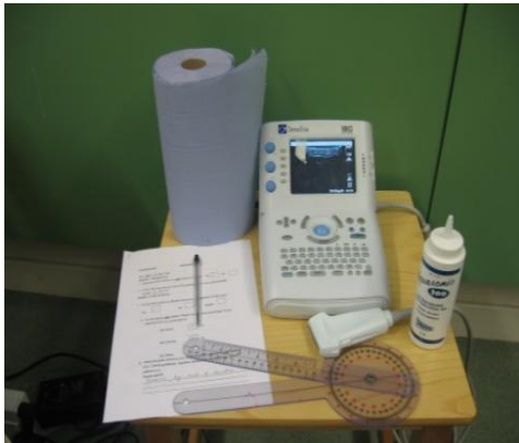
Figure 1: SonoSite 180 Plus Ultrasound System.

the transducer placed in sagittal plane, just proximal to calcaneal insertion (Leung and Griffith 2007; Dong and Fessell 2009) (Figure 3). Distances were measured by built in calipers at the level where the tendon separates from calcanei, at a point where the thickness was observed to be at its maximum (Bjordal et al 2003) (Figure 4). This site was chosen for measuring tendon thickness as it is the most frequent site for tendon pathology (Gibbon et al 2000). Blinded measurements were performed on both the occasions by covering the readings on the monitor screen. Data was recorded by another observer who was not a part of the study.