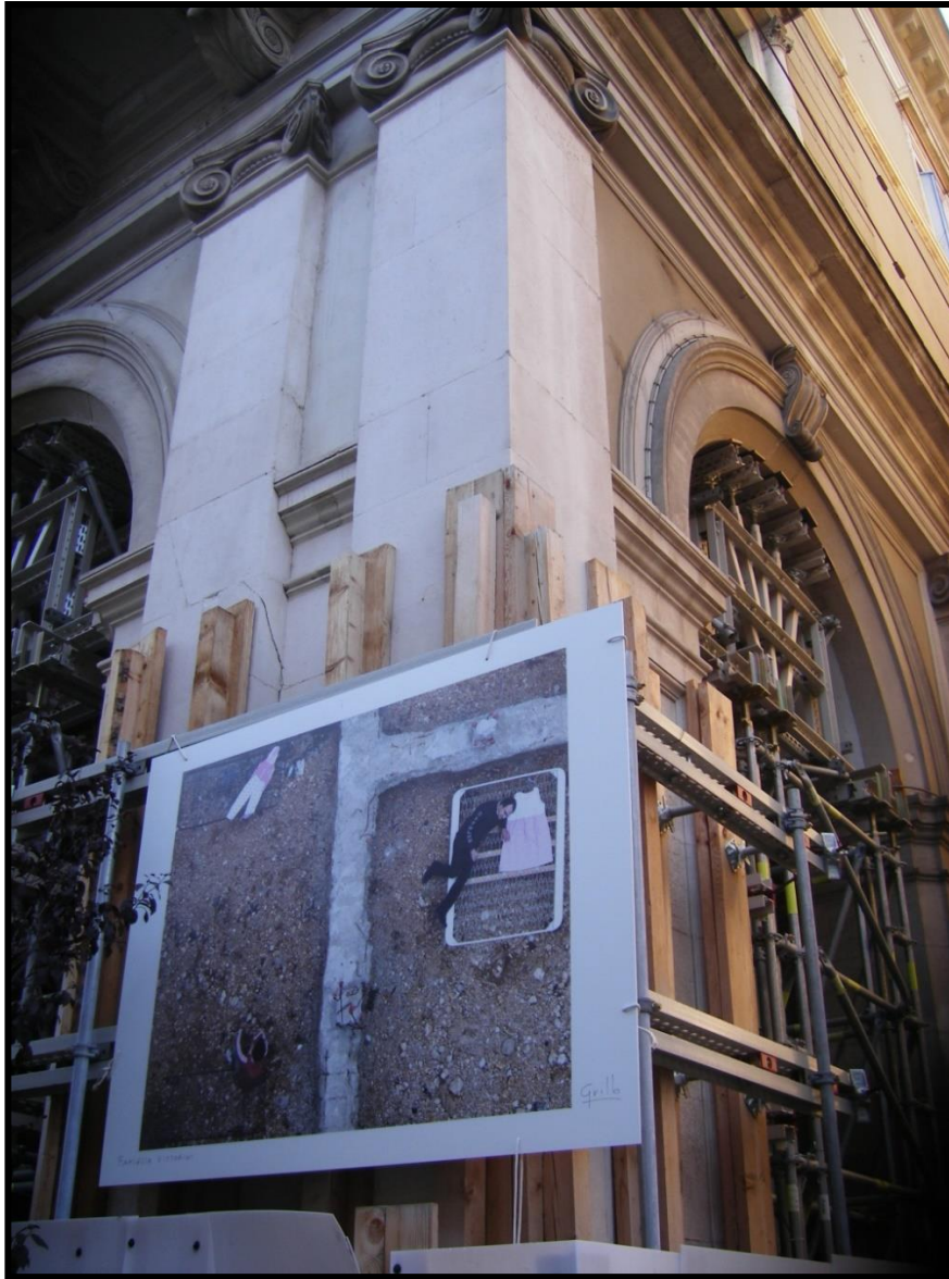
Figure 1: The photograph in situ, L'Aquila