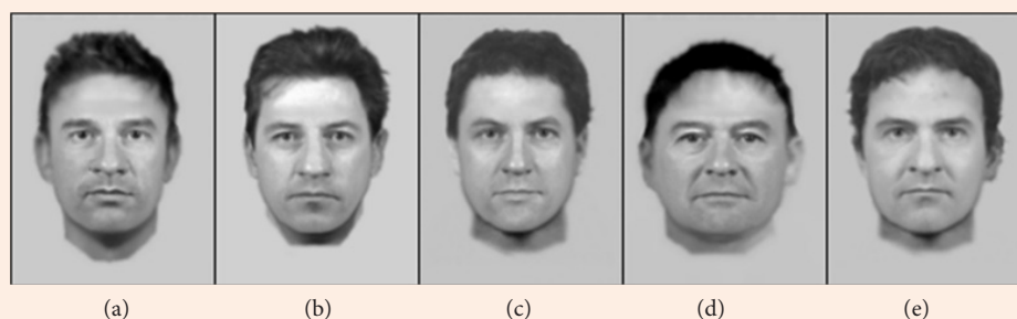
Figure 2: Example composites of actor Karl Munro constructed by condition:

Design: Composite likeness ratings was a within-subjects' design, with further participants rating both upper and lower halves of composites constructed from all five conditions.