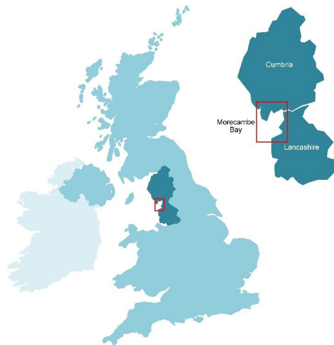
Figure 2. Case study area (Morecambe Bay, UK)

The bay dominates local history, the natural environment, landscape and, arguably, offers the most distinctive element to the visitor experience. The bay is not only a vista but provides specific elements of the experience such as beaches, wildlife/nature reserves, fishing, local produce and even the renowned cross-bay walks with The Queens Guide to the Sands. Thus, Morecambe Bay is a famously dynamic natural environment, which is distinct and seems likely to inform the tourist experience through the products, activities, and vistas it offers. Indeed, the regional tourist board responsible for the southern part of Morecambe Bay describe it as ‘a place with unique wildlife and habitats and a great place for outdoor adventures’. Their website promotes the destination in terms of walking, cycling and ‘wildlife adventures’, boasting of ‘nature’s amphitheatre’ (Visit Lancashire, 2017). Evidently, the bay offers the potential of a clear destination identity for this area in terms of tourism marketing.