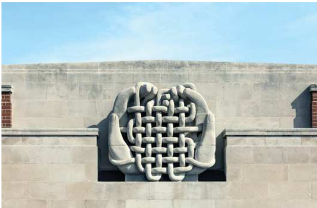
Figure 3. Mitzi Cunliffe. Newly conserved Man-Made Fibres . 1956. Ornamental sculpture atop the middle of Clothworkers South Building (visible in Figure 4).

improvisational play around the site, the stairs, railings, and walls, and with shape, form and idea of weaving, intertwining, and use of the hands from the sculpture . . . The theme of man-made fibres was taken more directly by using large swathes of lycra fabric in which the dancers, wrapped and unwrapped themselves into sculptural forms in and around the site. The result was a journey from exploring to owning the site and enabling the audience to see the sculpture through the physicality of the dancers. [internal e-mail, June 2016]