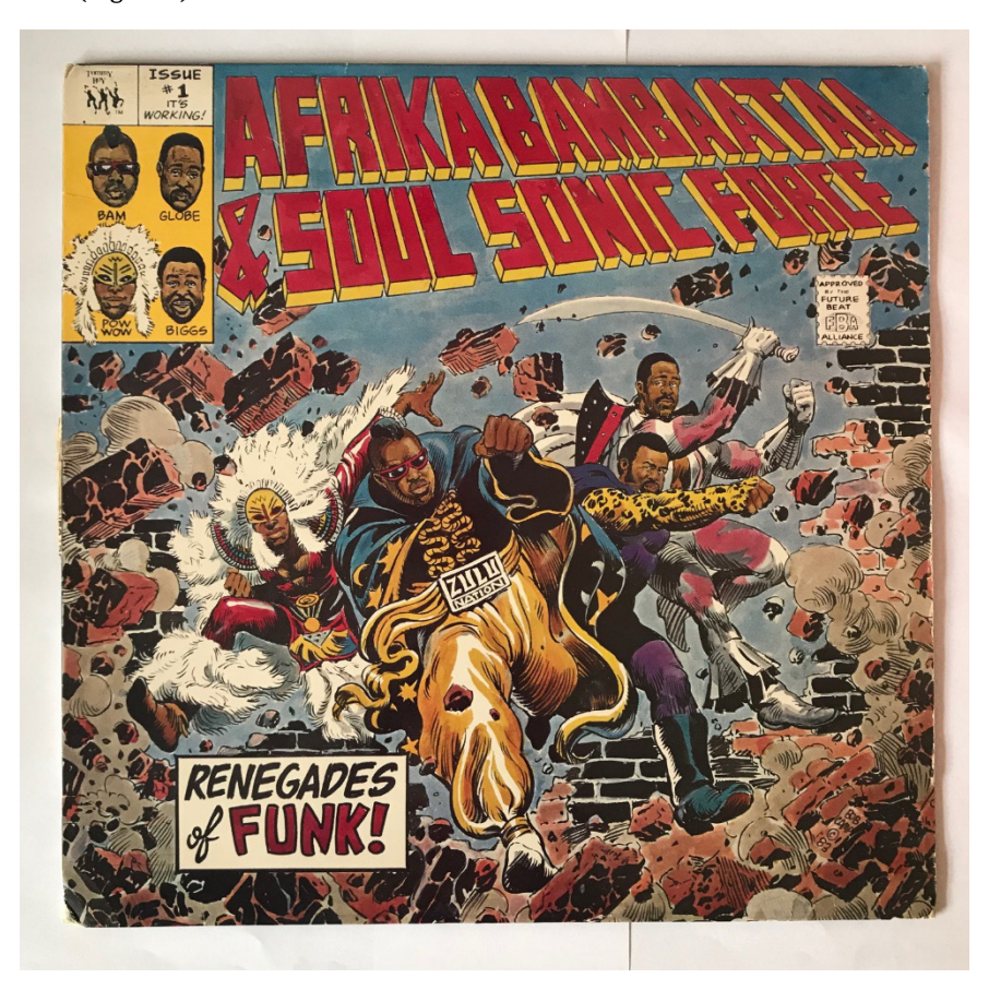
Figure 1. Front cover of "Renegades of Funk" illustrated by Bob Camp.

The debut album "Jam on Revenge" was released in 1984, when full hip hop albums by a single artist were still uncommon. Following the success of the songs "Jam on Revenge", originally released by Mayhew Records in 1983 under the artist name Newcleus Featuring Cozmo and The Jam-On Production Crew, and "Jam on It" (Sunnyview, 1984), the album embodied fantastic artwork in the style of a comic book. "Jam on Revenge" was not the first to take this visual approach—Afrika Bambaataa and Soul Sonic Force's single "Renegades of Funk" from 1983 depicts the members of the group as superheroes bursting through a brick wall (Figure 1).