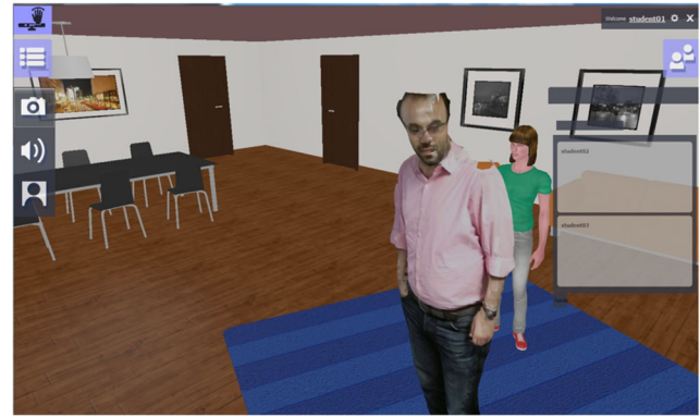
Fig. 3 REVERIE virtual hangout scenario session with replicants

The most realistic human representation is achieved in REVERIE by means of "replicants". By replicants, we refer to a dynamic full-body 3D reconstruction of the user. The REVERIE visual "Capturing" module is responsible for capturing a user during a live session with the use of multiple depth-sensing devices (Kinects) and dynamically reconstructing a 3D representation of the user (including both 3D geometry and texture) in real time. The user moves inside a restricted area, surrounded by at least three Kinect devices, while standing in front of the display interacting with other participants. The "replicant" reconstruction is coded in real time and transmitted in order to be visualized on other users' displays along with the elements of the shared virtual world, see Fig. 3. Alexiadis et al. [22] discuss in detail the reconstruction module's pipeline for capturing and 3D reconstruction of replicants.