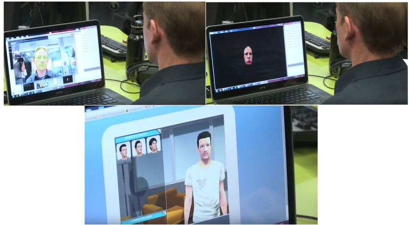
Fig. 1 RAAT tool preliminary testing

analysis of the data provided by both a Kinect V2 and HTC Vive and creates a virtual body for the user that moves and acts as their own and can be perceived from a natural first-person perspective [18]. SomaVR aims to enable players feel physically grounded as their virtual body replicates their own. However, SomaVR does not support facial expressions.